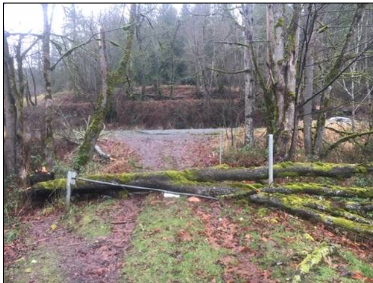
Damage to an access gate at the Stillwater Unit by a recent windstorm

Wind Storm 2019: Snoqualmie Wildlife Area Manager Brian Boehm reports a combined seven trees blew over along access roads and parking lots at Stillwater, Cherry Valley, and Crescent. Two of the trees damaged an access gate to the middle entrance at Stillwater Unit. Some cleanup has been started.