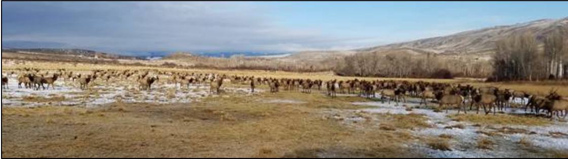
Elk on feed site Saturday morning

Feeding continues with a few new elk still showing up. We had five inches of new snow this week at the feed site.