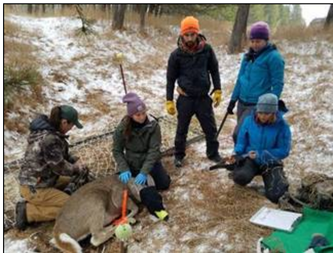
Clockwise from top left: A clover trap set to catch white-tailed deer. An enticing salad used to lure in deer. University of Washington, Kalispel Tribe, and WDFW personnel collar a white-tailed doe in GMU 117.

Predator-prey Study: Biologist Lowe assisted DeVivo and Turnock with processing of a white-tailed deer fawn captured in a clover trap near Newport. The fawn was fitted with a radio collar and released.