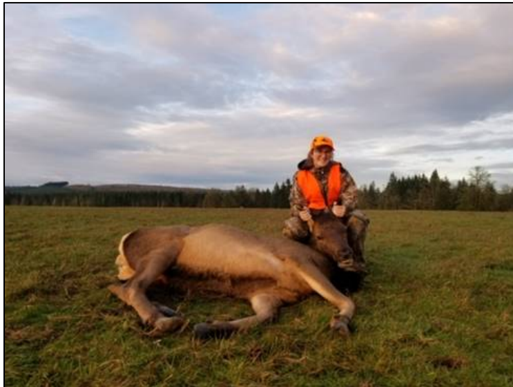
Successful youth hunter on the Boultinghouse Farm.