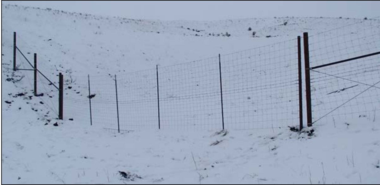
Breakaway in large draw with multiple t-posts pounded in on the downstream side of wire