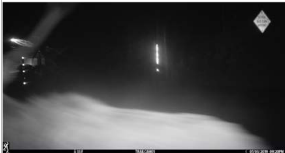
Bull elk 1 second after noticing the stuffed cougar and jumping 8' out of the way!