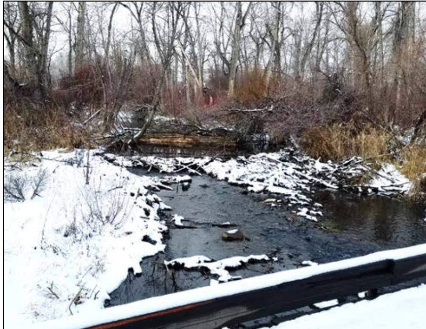
Looking upstream from bridge at new tree across creek