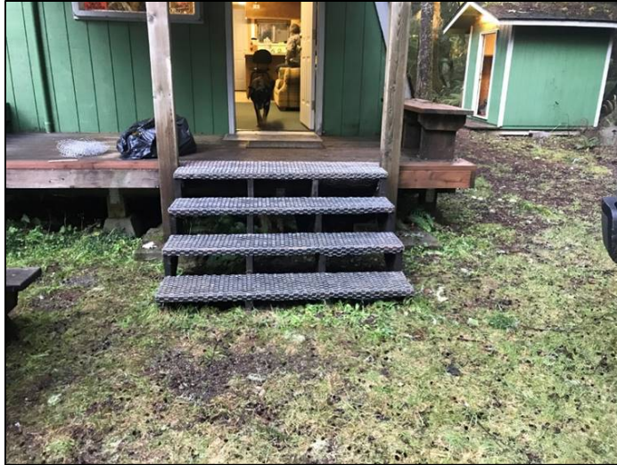
Steps are now safe again!