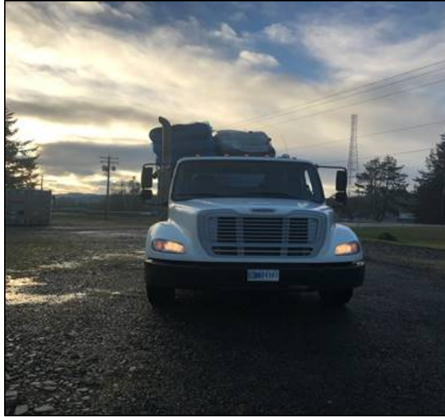
Shifted truckload of fencing