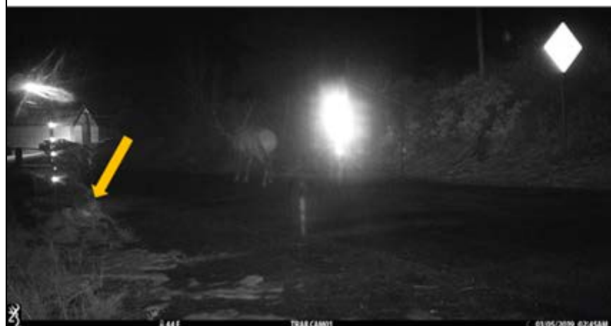
Might as well cross, since the cougar is not doing anything...