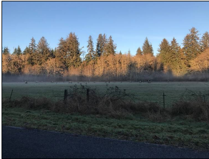
One of the local Clearwater elk groups was using the Donkey Creek field