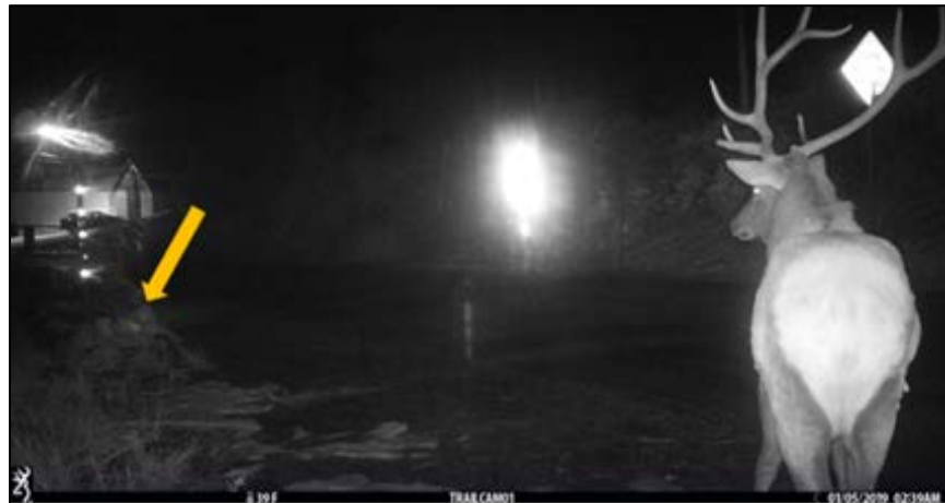
Bull elk checking to see if the stuffed cougar is still there

On the second night, after multiple approaches, and a good foot stomp within two feet of the cougar, the bulls realized that the stuffed cougar was not going to do any “cougar stuff” and proceeded to cross the cattle guard, but on the opposite side of the guard from the cougar (just in case!).