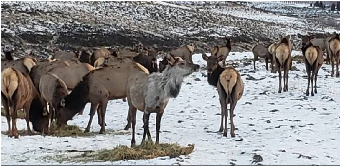
Interesting color on this Cowiche elk

Oak Creek staff members began feeding elk at the Cowiche feed site on Jan. 10 following accumulated snowfall of about three inches over the area. Nearly 800 elk were counted that first day with a peak of over 1,200 by the end of the week.