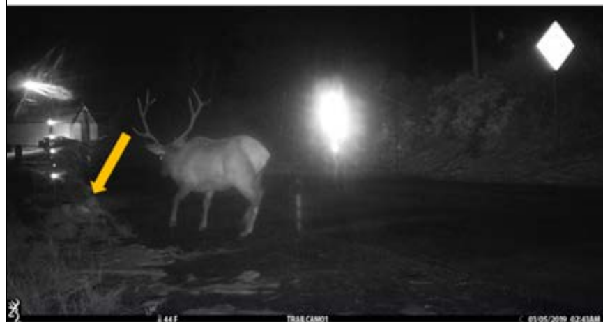
The same bull elk, challenging the stuffed cougar