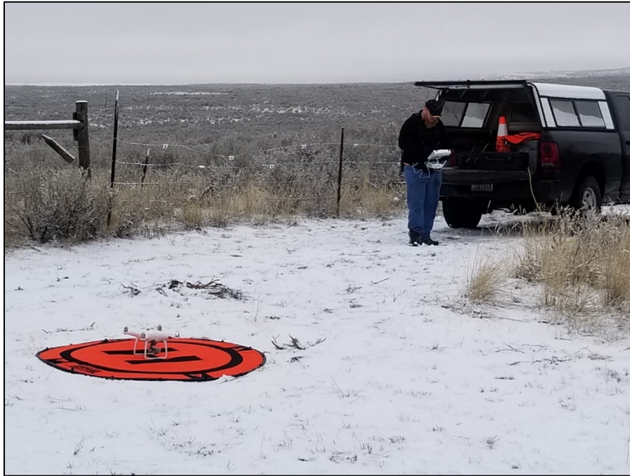
Drone operator preparing for takeoff on pygmy rabbit survey

The same weather problems are plaguing our ground effort and limiting the drone effort. The lack of snow being the biggest limiting factor, followed by near constant low clouds and patchy fog that sit over the Columbia Basin during the winter months. We have completed about two-thirds of the Burton Draw release area, but are still waiting on the data to process to see if the imagery is suitable (very little snow and dense overcast).