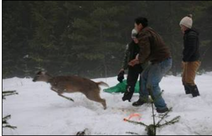
WDFW biologists release radio-collared fawn