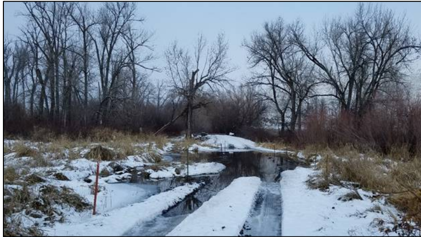
Water over feed road, looking north towards bridge