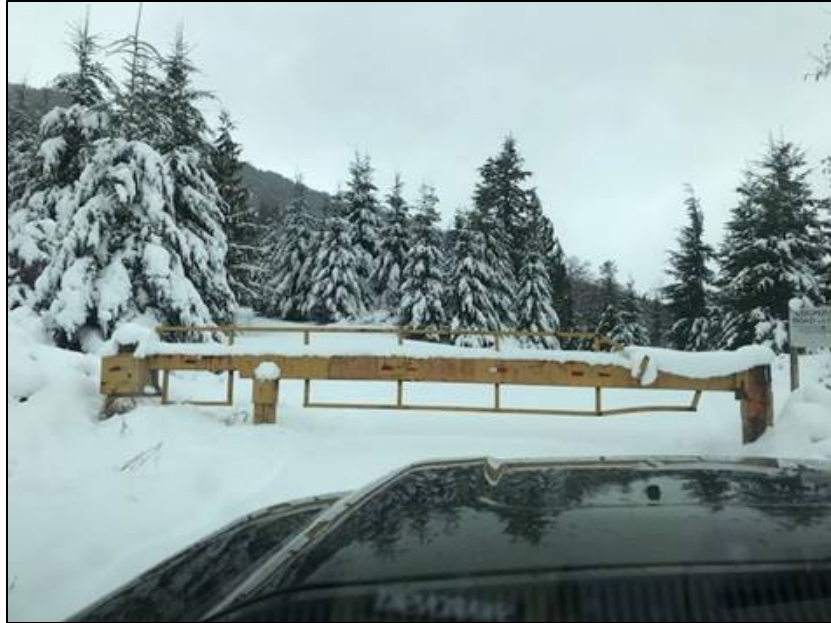
Heavy snow in GMU 418 during the late archery hunt

Wind Storm 2019: Snoqualmie Wildlife Area Manager Brian Boehm reports a combined seven trees blew over along access roads and parking lots at Stillwater, Cherry Valley, and Crescent. Two of the trees damaged an access gate to the middle entrance at Stillwater Unit. Some cleanup has been started.