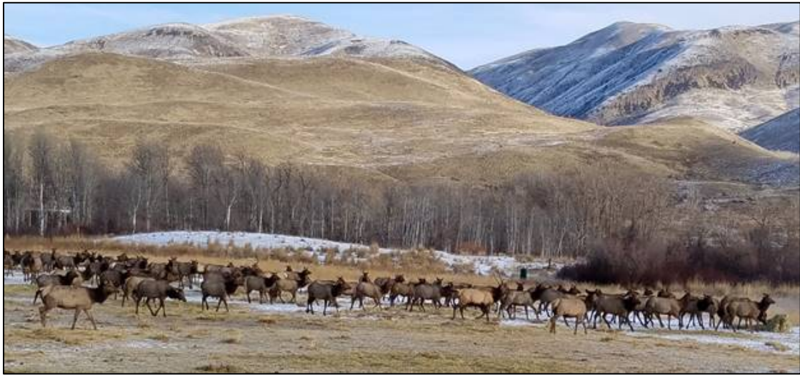
Elk heading for the hay