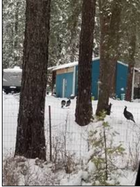
Turkeys in a residential neighborhood of Loon Lake