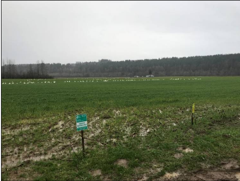
Swans enjoying winter wheat purchased with state duck stamp funds

Parking Lot Cleaning: The water access team spent several hours in Thurston County, concentrating on cleaning up limbs and asphalt after the recent storms. Several trees also blew down and property fences were damaged, all of which were documented and will be repaired after all sites are inspected and the first stage of cleaning up is complete.