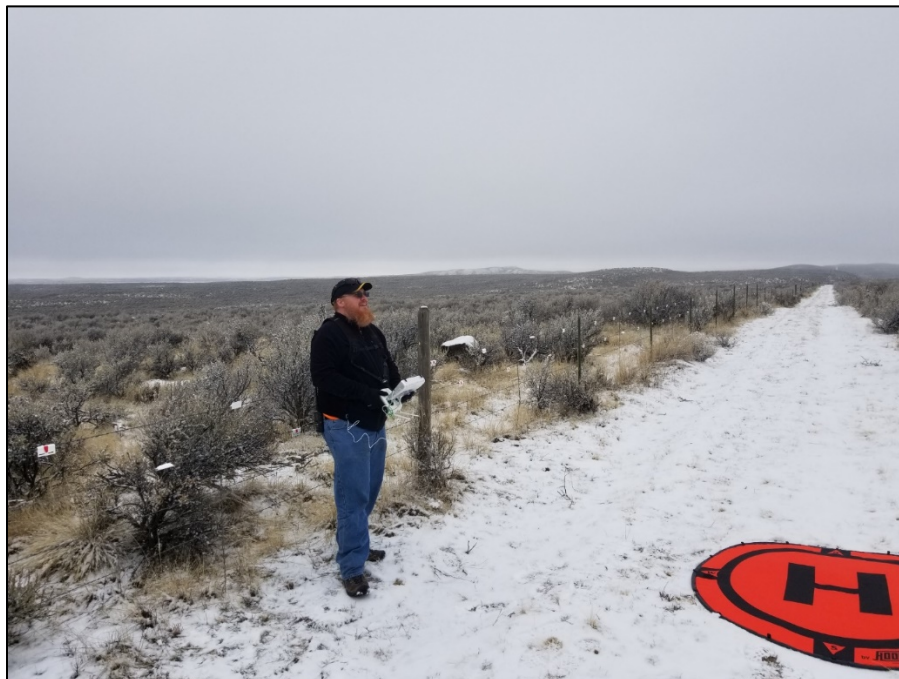
Drone operator monitoring the drone as it covers the survey transect on autopilot