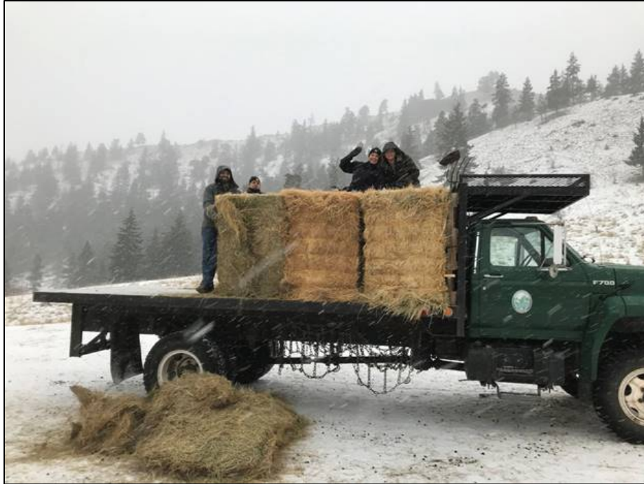
WDFW Human Resources crew braving wintery conditions to feed the elk in the L.T. Murray