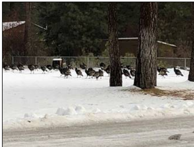
A photo taken by a landowner working with WDFW on turkey in Loon Lake