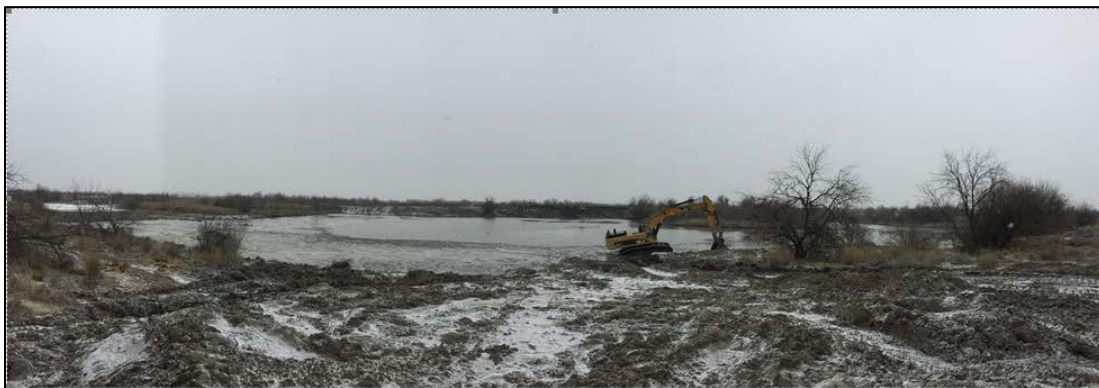
Winchester excavations