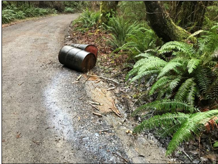
Drums of an unknown substance dumped along a private timber company road that is open to public access