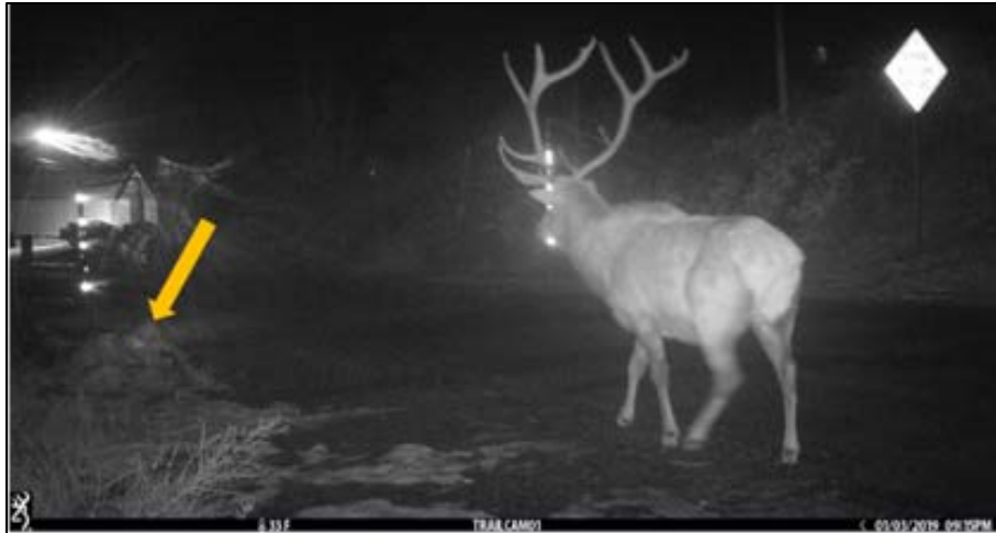
Bull elk 1 second before noticing the stuffed cougar