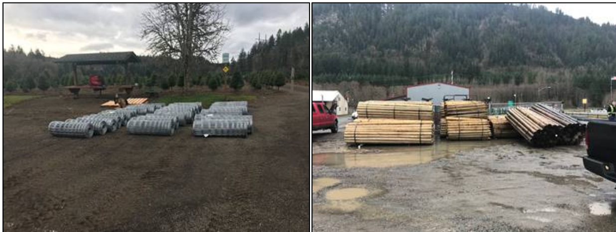
Dunn Christmas Tree Farm fencing. Cost share fencing materials stored at Timber Wolf. Feed in Morton.