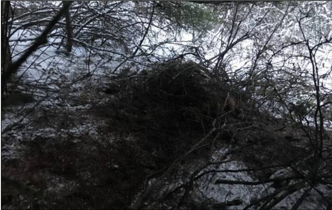
Domestic goat covered with debris by cougar

Assistant Manager Winegeart assisted enforcement officers with moving a cougar trap from one property to another in Cle Elum. A cougar had killed a domestic goat that had been allowed to roam a wooded area at night.