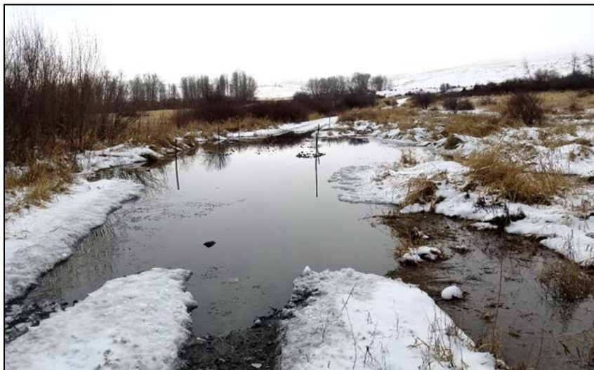
Water over feed road, looking south towards feed site

Manager Confer Morris and Assistant Manager Taylor met onsite to look at the Mellotte feed road and bridge. Significant amounts of water continue to flow over the feed road just south of the North Wenas Creek bridge crossing. Traveling through around one foot of water to and from the feed site is wetting down the brakes on the feed truck, causing them to freeze during the night. There is also a recently fallen tree, just above the bridge that, if mobilized by a high water event, is too large to go under the bridge. They will be in touch with Area Habitat Biologist Bartrand in the next week to discuss options to address both issues.