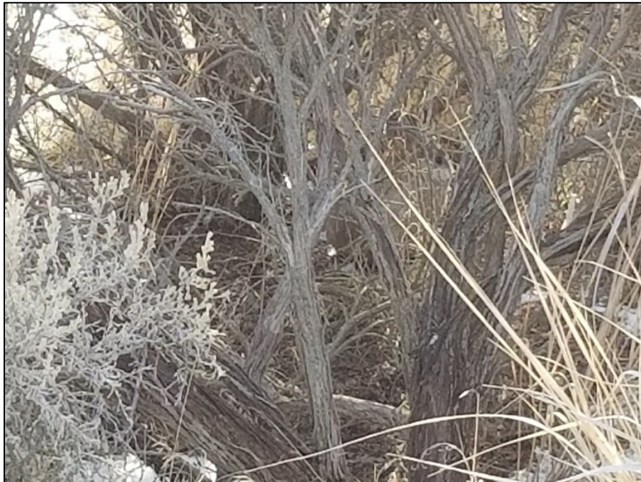
Where's Waldo the pygmy rabbit? See if you can find it!

Pygmy Rabbit Drone Effort: Alongside the traditional approach of transect surveys for the wild population, we have been attempting to utilize drones to survey rabbit distribution on the Beezley Hills and Burton Draw recovery areas. The goal is to demonstrate drone imagery can detect the rabbit tracks/burrows in the snow and determine the distribution and survivorship of our release effort this past summer.