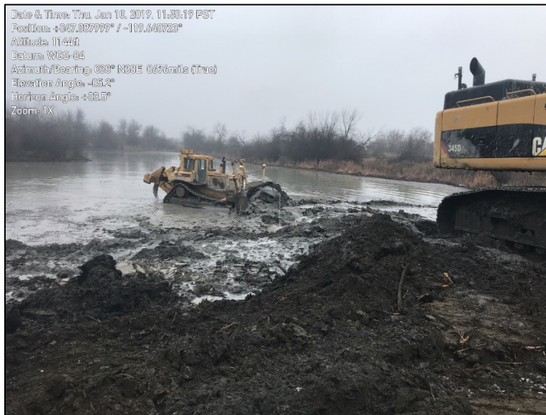
Pushing muck

Wetland Projects Site Visit: Lands Operations Manager Finger and District Wildlife Biologist Dougherty toured the Winchester excavations and Winchester regulated access area ditching project to observe outcomes first-hand. A large dozer and an excavator work in tandem to push material to the shoreline, where it is either left or hauled a short distance.