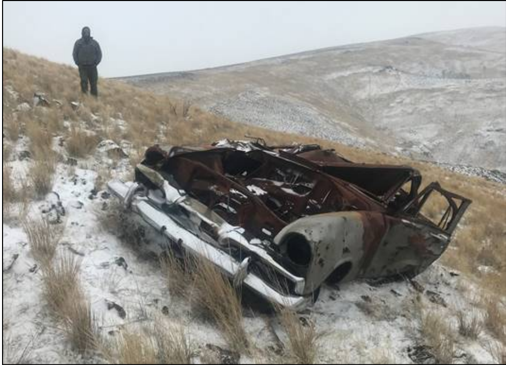
Junk vehicle in Quilomene Canyon