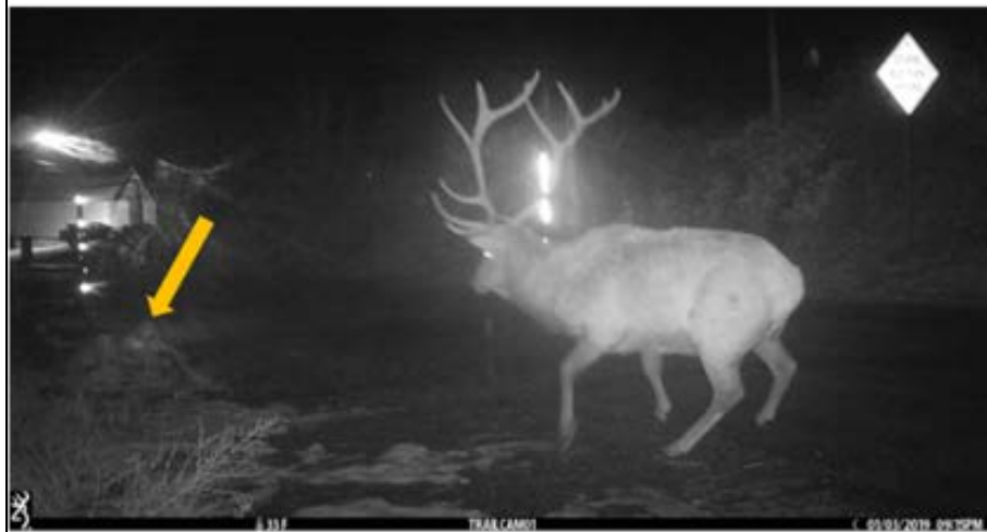
Bull elk just noticing the stuffed cougar