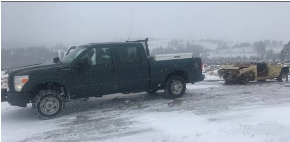
1976 Datsun pickup being pulled to a tow truck access point on Beacon Ridge