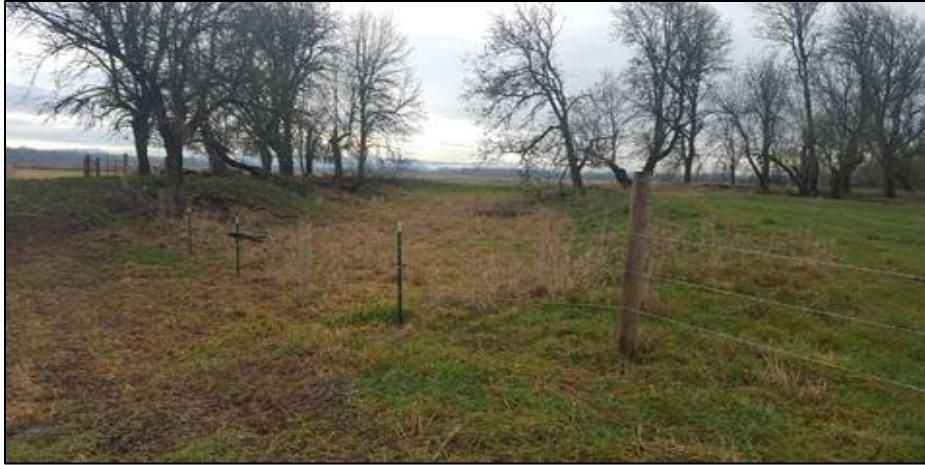
New fence in the Shillapoo North Unit