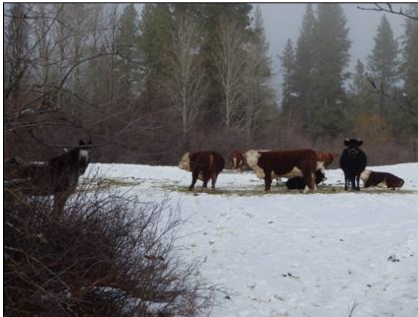
RAG location near Liberty

A wolf telemetry signal was picked up near Liberty this week. The battery on the Radio Activated Guard (RAG) was replaced with a fresh one at a location near Liberty. No incidents were reported.