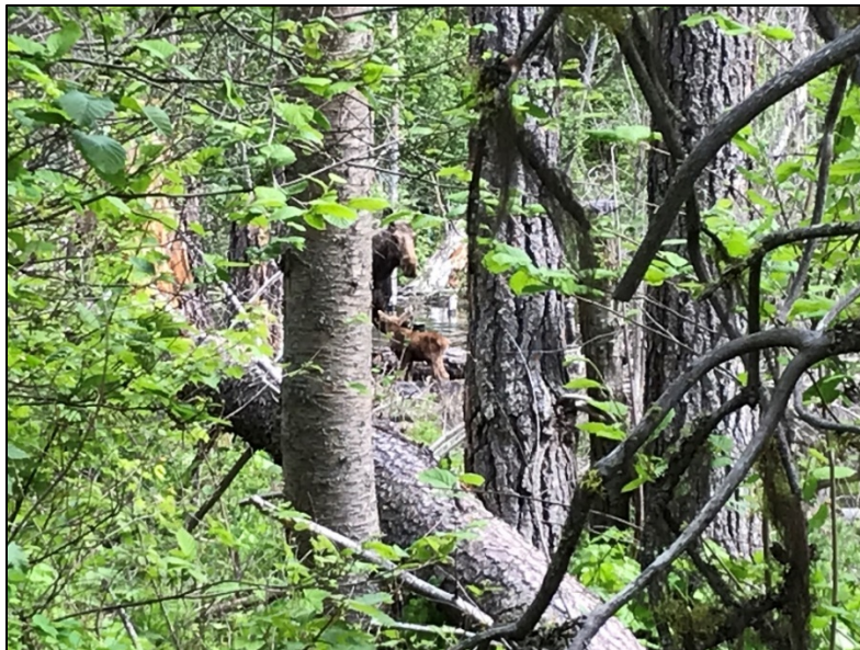
A cow and calf grazing in a wet area just outside of the prescribed fire unit as the unit was being burnt. Sherman Creek Wildlife Area

Klickitat Wildlife Area Grazing Monitoring: Range Ecologist Burnham monitored long-term plots on the Kayser-Davenport permit on the Soda Springs Unit. The permit will be up for potential renewal next year. New monitoring plots were established on the Fisher Hill Unit to better reflect where future grazing utilization can be expected in the event of permit renewals next year.