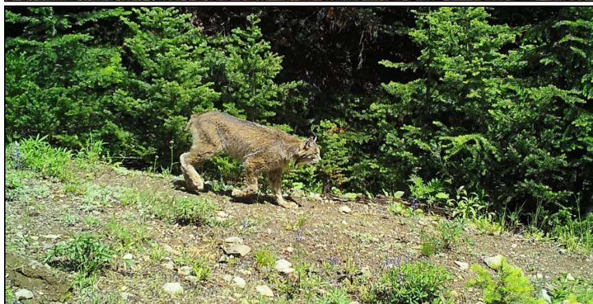
From top: Pair of cougars out for an evening stroll, curious black bear, Canada lynx