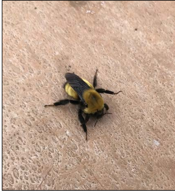
Bumblebee found on the Columbia River Wildlife Area