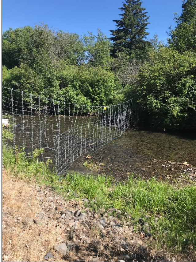
New electrified mesh on the Taneum fence