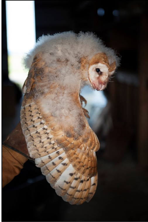
A fledgling barn owl with some remaining downy feathers