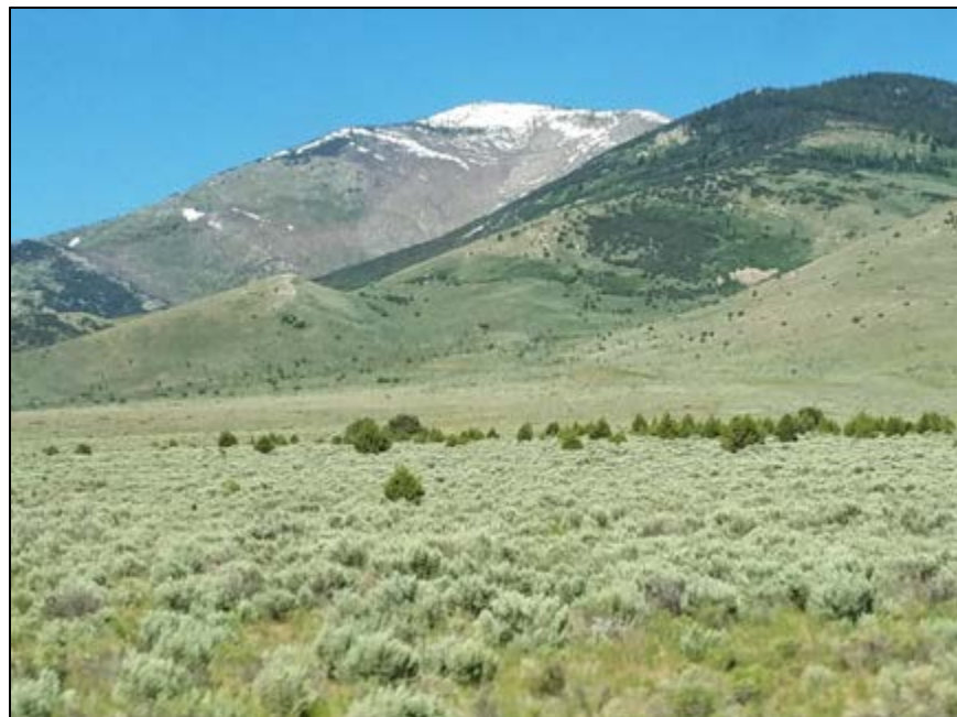
Southern Idaho juniper removal project

Working with landowners was the highlight of the tour and included a visit to Della Ranch in northern Utah to observe juniper removal and watershed restoration projects. Many great discussions took place that will enable future on the ground efforts in several states. Washington was well represented at the conference with two WDFW staff members and several Washington State Natural Resources Conservation Science (NRCS), Sage Grouse Initiative, and Pheasants Forever staff members.