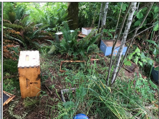
Bears really like honey!