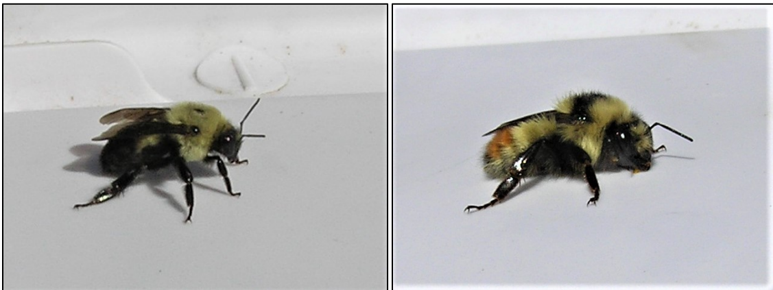
Two species of bumblebees found on the Sunnyside Wildlife Area