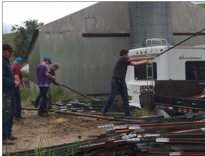
Kid's Kamp participants sorting used t-posts for reuse or disposal

Asotin Creek Wildlife Area Back Country Horsemen Kid's Kamp: The Twin Rivers Chapter of Back Country Horsemen (BCH) hosted their annual Kid's Kamp at the buildings at Smoothing Iron Ridge. The goal is to teach young people horseback riding skills in mountainous areas, environmental awareness, and camping/survival skills. There were about 25 participants who camped out in and around WDFW's buildings. BCH members used the Schlee house for preparing meals as well as having a place where participants could shower up after a long day on the trail.