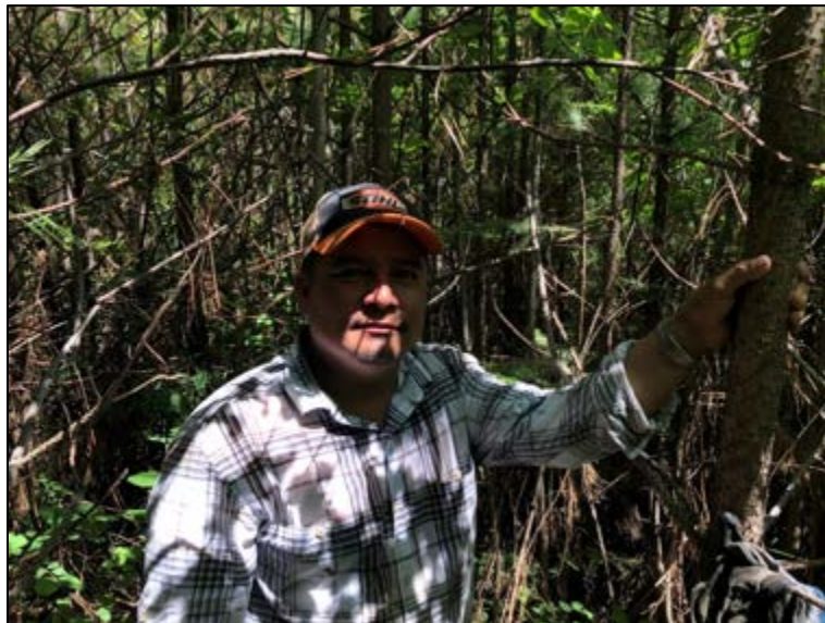
Foreman on the W.T. Wooten Wildlife Area precommercial thinning project is working in a particularly dense thicket of pine and hardwood brush

Wooten Wildlife Area Forest Thinning: Thinning and piling is complete along Tucannon Road, and nearly finished off Mountain Road on the Wooten Wildlife Area Precommercial Thinning Project. Slash piles along roadways will likely be burned this fall. Trees are now free to grow and should make beautiful pine stands until the next management entry. Stands on this project ranged from very dense thickets to moderately dense planted ponderosa pine plantations to roadside fuels reduction under established canopy.