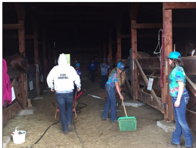
One of WDFW's barns being used by camp participants for housing horses