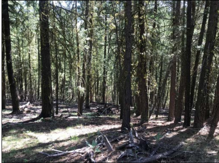
Ramsey restoration thinning photo point two pre-harvest condition