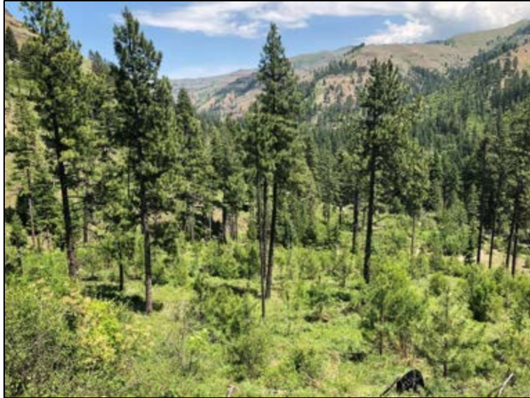
Recently thinned ponderosa pine stand that previously contained over 1,000 ponderosa pine saplings per acre