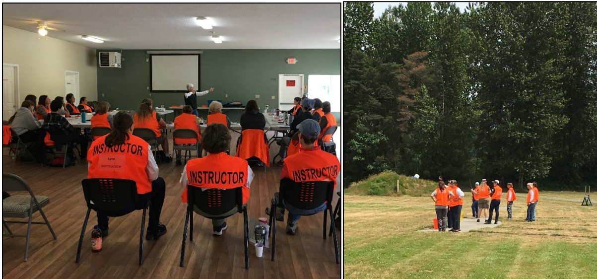
WOW shotgun workshop participants and instructors in the classroom and on the range