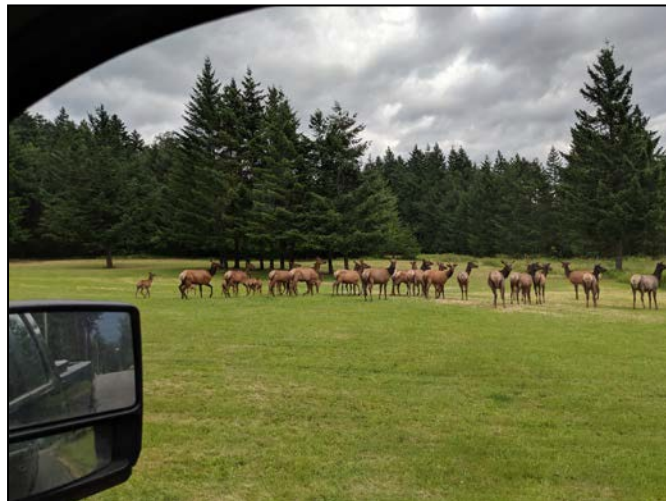
Thirty elk in a field across the street from where a cougar depredated on a chicken the day before