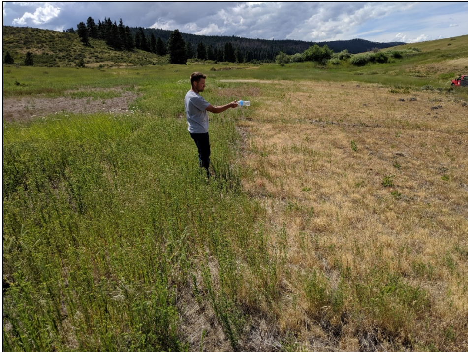
Laramie 25DF plot