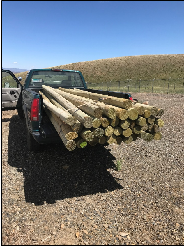
Posts ready to deliver to one of four cost-share fencing projects in Kittitas County

Several hay growers called to request elk damage permits for elk in hay. The landowners were advised that permits would not be issued until August. They were advised to conduct non-lethal hazing and other methods to keep elk out of hay fields.