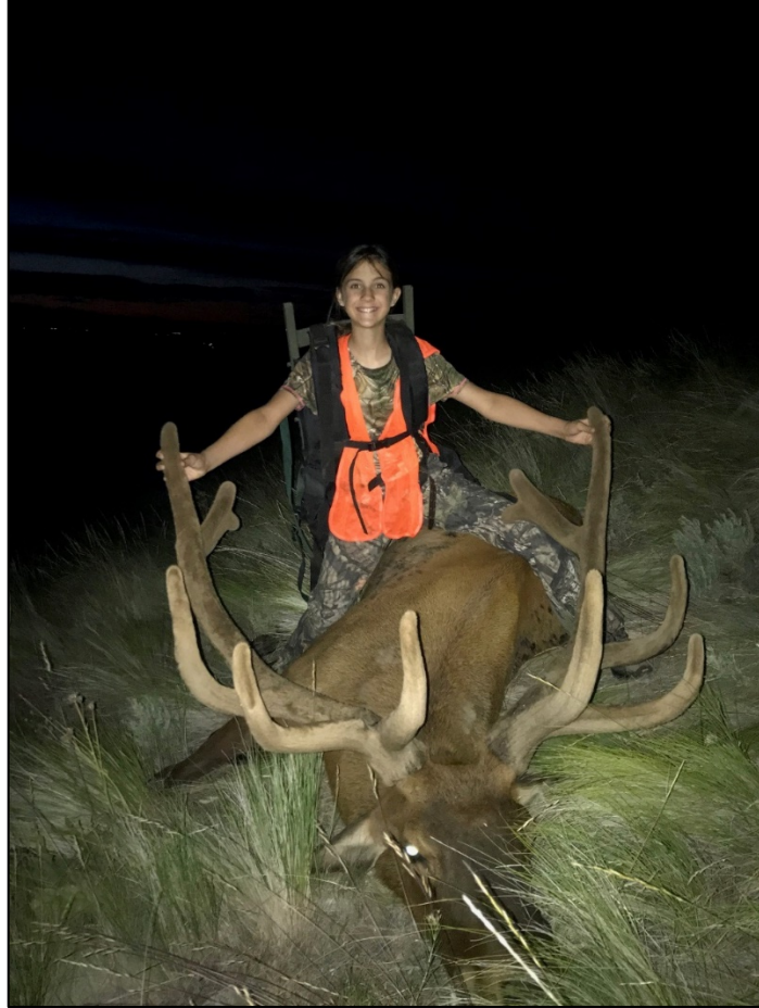
Youth damage permit hunter with her first elk