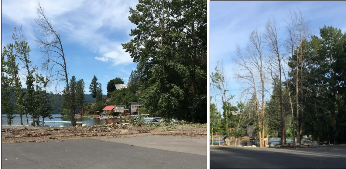
Newman Lake cottonwoods, before and after