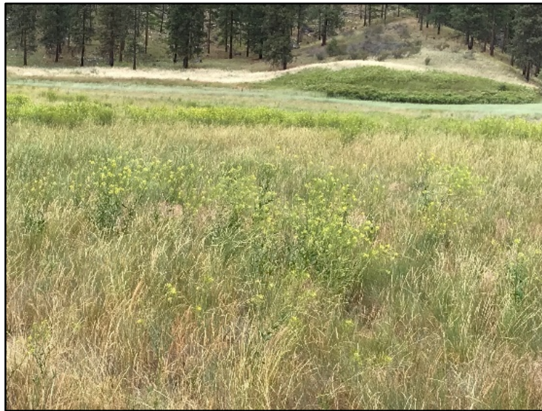
Native restoration site on Sinlahekin Wildlife Area