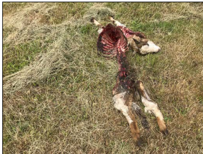
Carcass of goat that was killed by coyotes