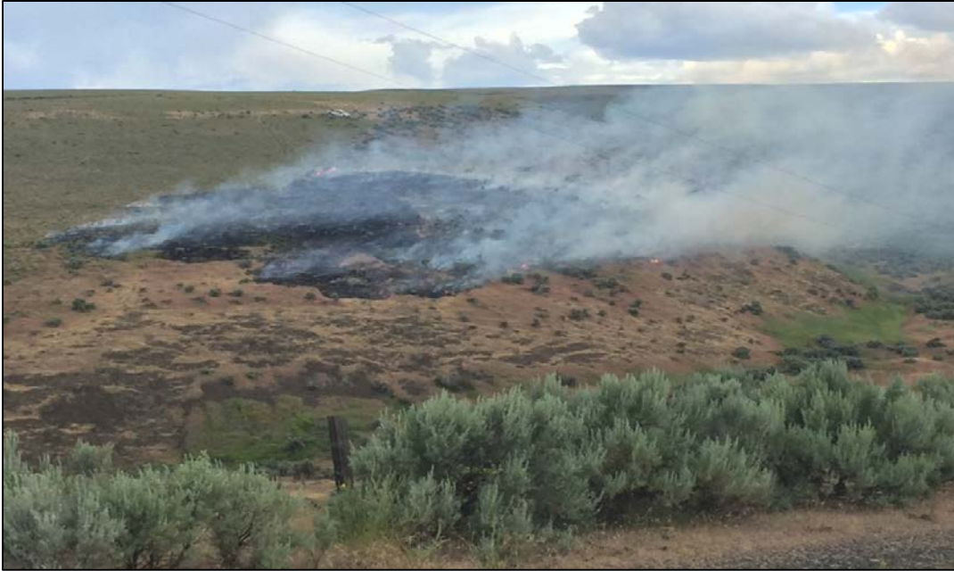
Fire at the Thorton Unit of the Sunnyside Snake River Wildlife Area