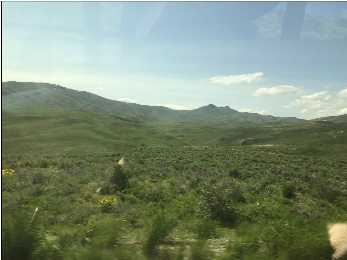
Portion of the Grouse Creek Watershed in northwest Utah viewed on tour

building and maintaining relationships, and the importance of maintaining large connected landscapes to provide fish and wildlife habitat. This is a challenge with human development pressures, but the low population and focus on ranching in this landscape make it possible.