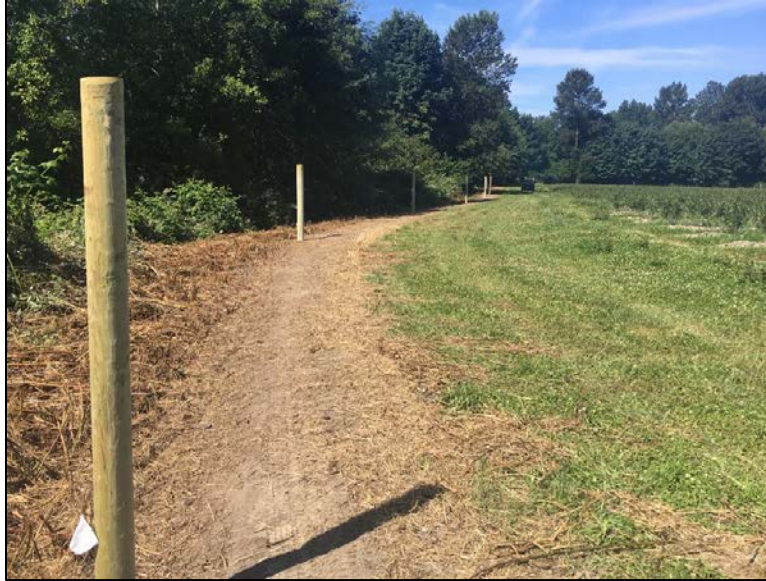
Wood posts being installed for exclusionary elk fence in Skagit County

Gate Installation: Wildlife Conflict Specialist Witman and Natural Resource Technician Cogdal completed some final installation of gates on a newly constructed elk fence in Whatcom County. When arriving at the property, the elk obviously found access through the gate openings the previous evening. The elk were herded out and gates were installed.