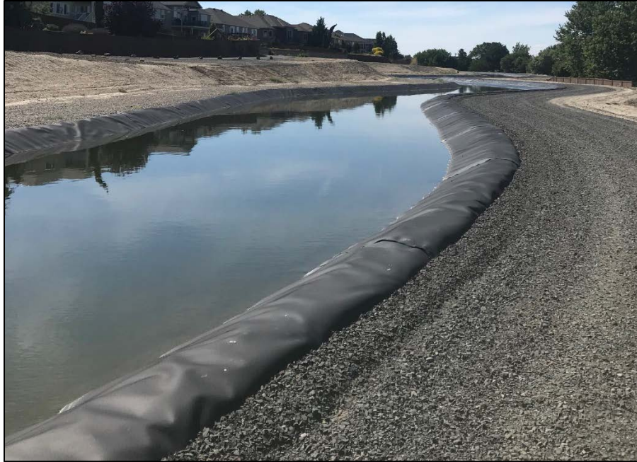
A previously earthen canal now lined with a textured plastic

Volunteers Trap and Band Geese for Research in Tri-Cities: District 4 Wildlife Biologist Fidorra and Waterfowl Specialist Wilson coordinated Canada goose trapping events on two dates this month near Tri-Cities. Several volunteers came to assist with corralling the geese using fence panels and kayaks, and then learned to age and sex the geese before they were marked with leg bands and released. Over 200 geese were captured which will contribute to nation-wide research on movement, harvest, and survival of the species.