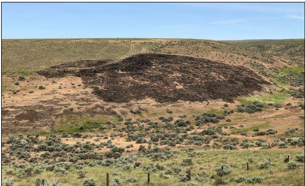
Fire after containment