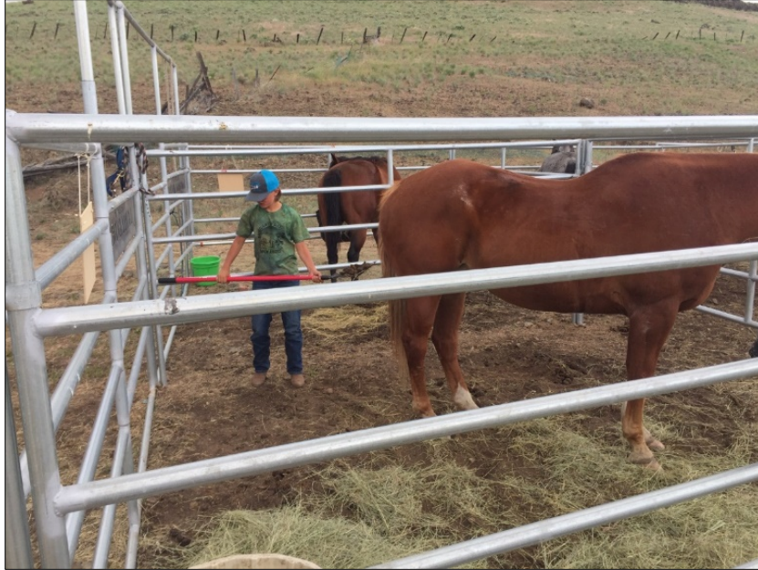
Cleaning up after their horse

W.T. Wooten Wildlife Area and State Parks Support: Wildlife Area Access Manager Dingman wrote a letter of support for State Parks to include in an application packet for a Bonneville Power Administration (BPA) grant they are applying for. The grant funds will be used to purchase an Emriver 2 portable stream table to use for educational talks in showing children and adults how rivers function and how floodplains are formed.