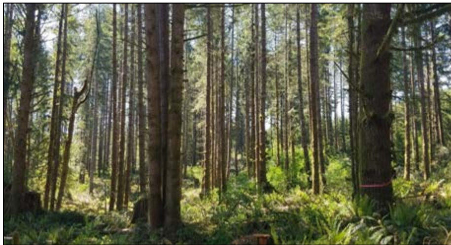
Thinned forest (June 24, 2019)

Prescribe (Rx) Burn Season, Spring 2019: Spring prescribed burning officially ended on June 11, 2019 on WDFW lands due to warm dry conditions. Rx fire crews will continue to monitor sites that received treatments to confirm no heat is remaining. During the spring, 1445 acres received prescribed fire treatments to eliminate decadent brush, unwanted and invasive plant species, and forest debris to improve wildlife habitat and reduce wildfire potential. WDFW fire crews will now focus to prepare for the fall burning season in previously thinned forest areas. Staff members anticipate burning on the Sherman Creek, Rustlers, L.T. Murray, Oak Creek, Grouse Flats, and 4-O wildlife areas this fall, said Fire Program Manager, Eberlein.