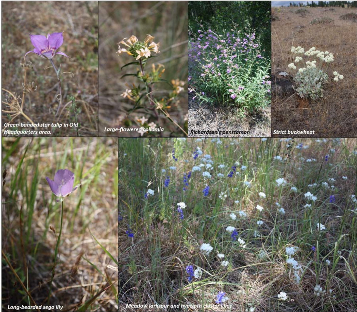
Green-banded star tulip in Old Headquarters area.