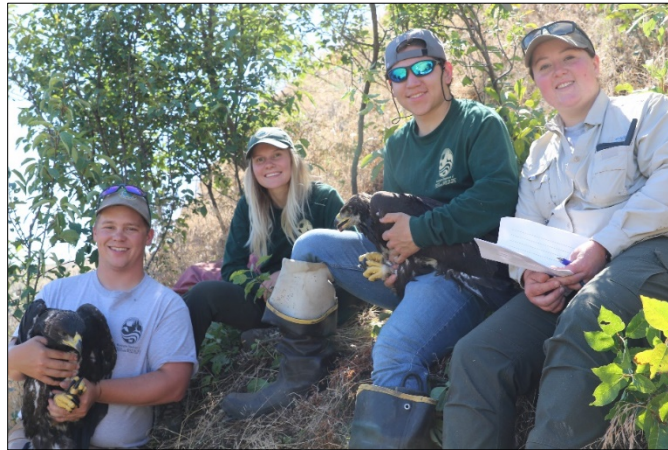
Blue Mountain Wildlife Area Complex University of Idaho interns with two golden eagle fledglings near Marengo