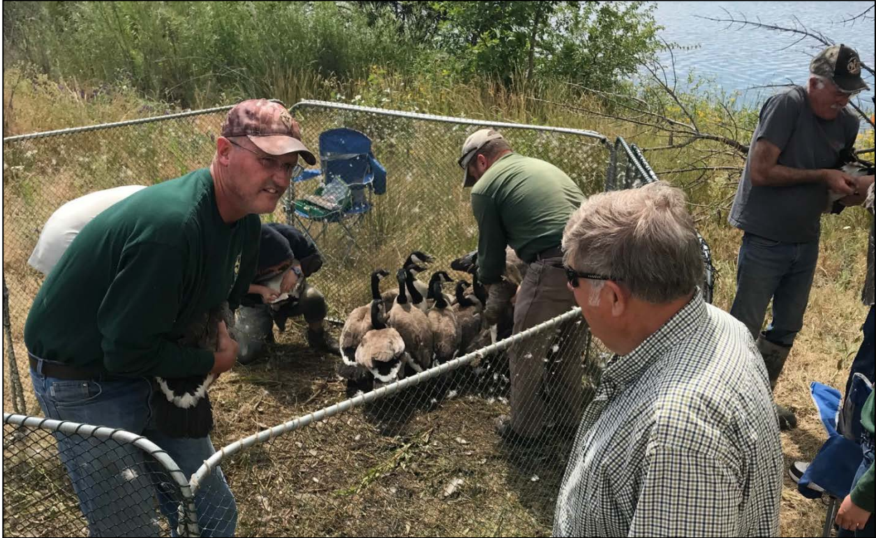
WDFW staff members and Richland Rod and Gun Club volunteers processing geese in the pen