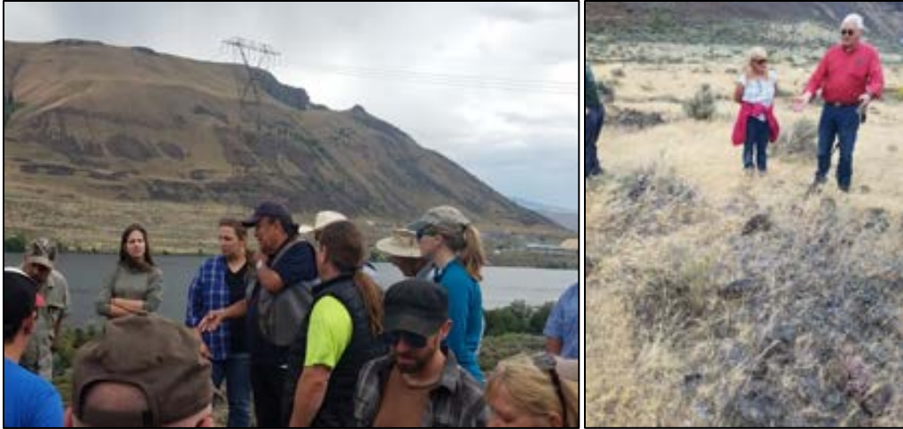
State and Tribal Historical Preservation Office archeologists training field staff on cultural resource issues