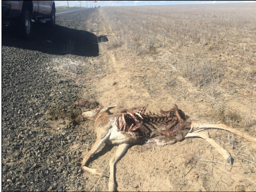
Roadkill pronghorn in Benton County