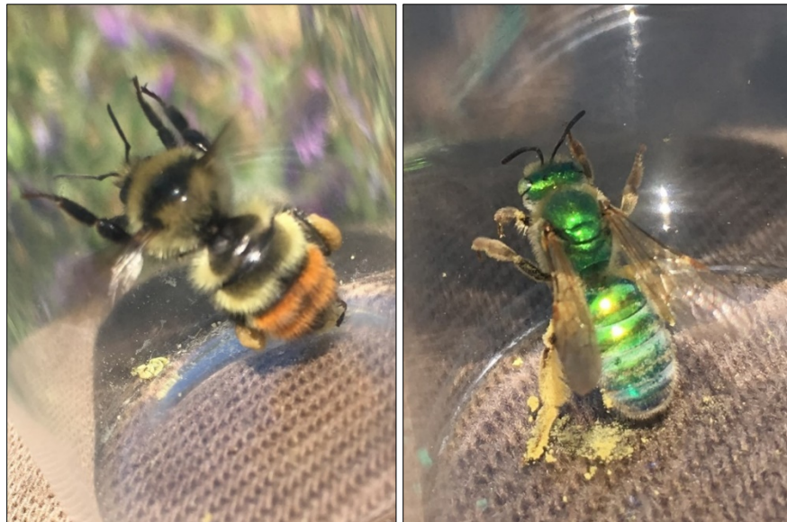
Central bumblebee and Metallic green bee from near Touchet, WA

Bumblebee Conservation: Assistant District Biologist Vekasy submitted the final bumblebee survey data for the two high priority cells in western Walla Walla County. Vekasy also submitted a number of incidental bumblebee sightings collected during other activities.