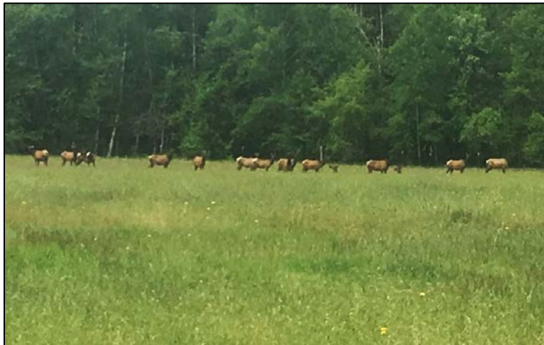
Elk group being herded out of a newly fenced hay field in Whatcom County