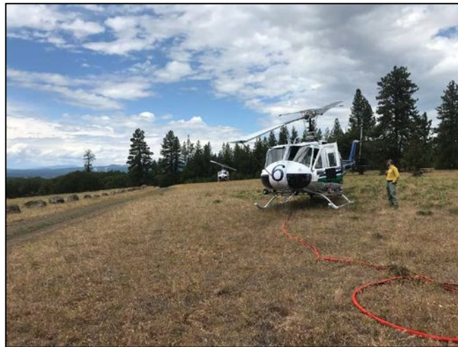
Two Department of Natural Resources helicopters on a temporary helipad along the Grayback Road

Fire Activity Near the Klickitat Wildlife Area: A wildfire was ignited near the Soda Springs Unit on Sunday or Monday, possibly by lightning. In a call to the dispatch center in Wenatchee, it turned out that the fire was a couple of miles away from the north end of the wildlife area. Due to steep terrain and difficulty of access, two DNR Helitac crews fought the fire while ground crews were enroute to the site. As it turned out, a rainsquall doused the fire at about the same time a 20-person crew passed the Klickitat Wildlife Area office on their way to the fire. The ground crew probably ended up doing mop-up instead of suppression of an active blaze. At a temporary helipad set up on the Soda Springs Unit, Wildlife Area Manager Van Leuven visited with the fuel truck driver and the two pilots. They were interested to meet a Helitac alumnus in the field (Van Leuven began her state service on a DNR Helitac crew in 1978) and a few stories were traded.