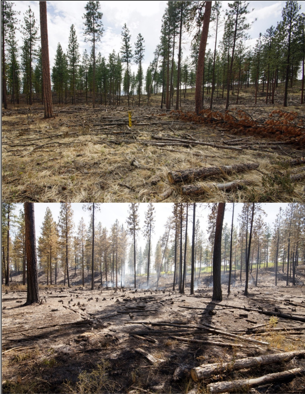
Before and after photos within the Bear Creek prescribed burn unit