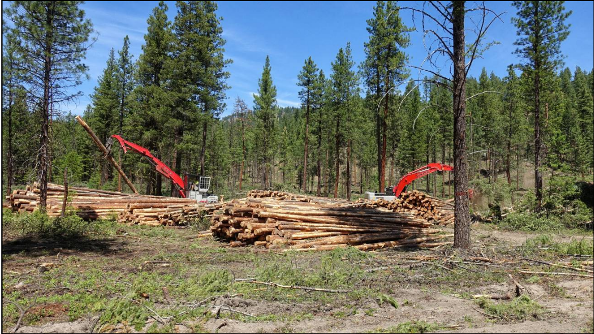
Crews working the log decks on the Ramsey Creek timber sale