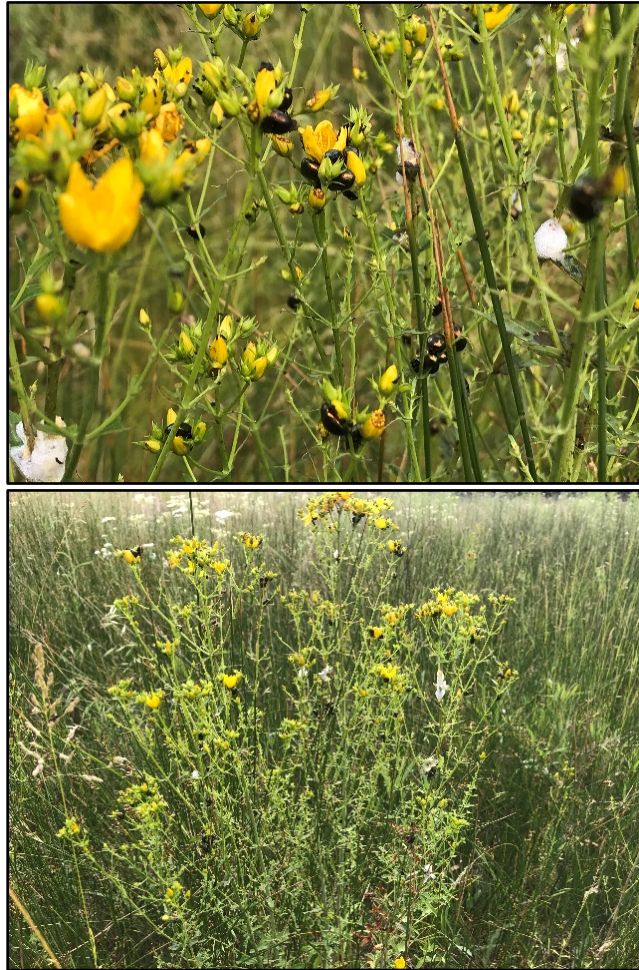
Chrysolina quadrigemina on St. John's wort

of areas on the Sinlahekin and Chiliwist units. When he was putting the releases out on the Sinlahekin, he noticed a heavy population of Chrysolina quadrigemina , a biological for St. John's wort, was active on many of the patches of St. John's wort in the valley. The C. quadrigemina has wintered well and is showing good population growth. There has not been a release in a few years.