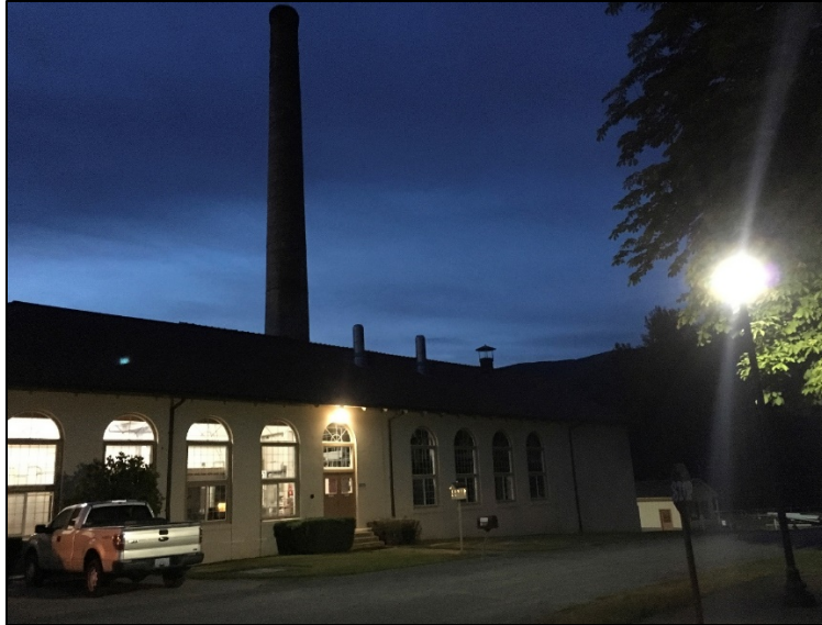
A building in Skagit County that houses a bat maternity colony and a site where yearly surveys are conducted