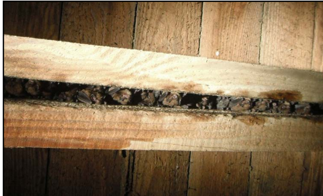
Little brown bats roosting inside a barn in Lewis County