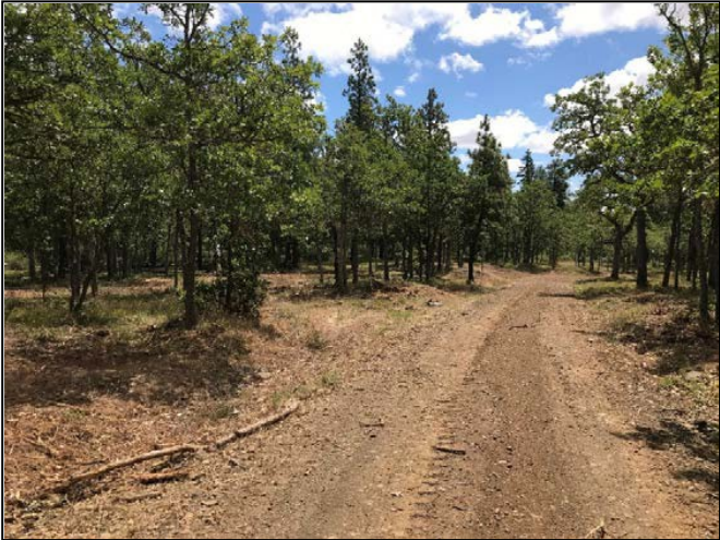
Shaded fuel break along Old Headquarters Road after tree pruning and brush and slash removal. A small tracked machine with masticating head mounted on an articulated boom performed very well in mulching shrubs and pruning debris, with minimal ground disturbance.