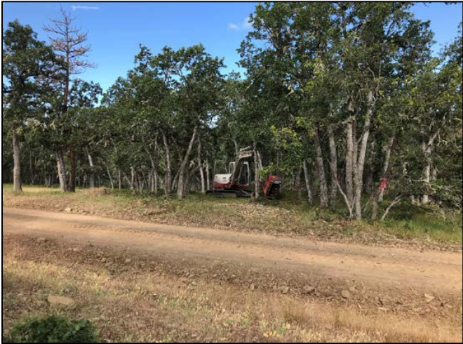
Masticating machine being used to chip limbs and brush along Old Headquarters Road

equipment is likely to produce better results than the skid-steer machine and the wildlife area staff members were eager to observe the quality of the work. Once all was in place, the disposal of shrubs and pruned limbs within a fuel break corridor on the Soda Springs Unit commenced. This material is left from work that was done by ground crew people during winter and spring. Assistant Manager Steveson met with the operator of the machine to go over the parameters of the project and checked on progress periodically. Assistant Manager Steveson also worked in the fuel break corridor to treat sprouting shrubs with herbicide. By controlling shrub growth, the frequency and cost of maintenance can be reduced and the fuel breaks will be more effective if they are needed. The maintenance work is in the final stages of completion now and Assistant Manager Steveson has been monitoring this activity and is pleased with the quality of the results achieved by a careful operator using a machine well suited to the job. Limbs pruned from the trees within the fuel break area are being mulched along with unwanted shrubs, with minimal ground disturbance or injury to nearby trees.