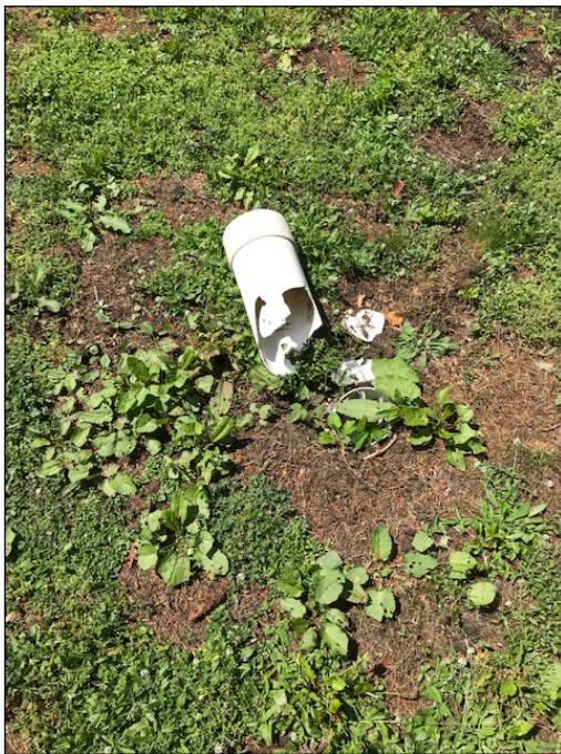
Broken Septic riser. Not bear damage