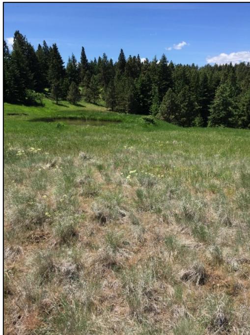
Steppe, old agricultural area, and pond, Weatherly Unit

Blue Mountains Wildlife Area Complex Grazing Monitoring: Range Ecologist Burnham monitored long-term plots on a grazing permit on the Weatherly Unit. This permit will also be up for potential renewal, next year.