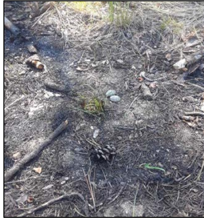
Ground nesting bird eggs located inside prescribed burn area three weeks after the burn (Methow Wildlife Area)

Just because there is fire doesn't mean the animals have to leave. There are concerns that prescribed fire chases away wildlife and destroys habitat. Actually, the prescribed burns we conduct are lower intensity burns with short duration. Wildlife have been seen coming back into burned areas overnight and between operational shifts. Other animals just move outside the area and return later to graze on the newly regenerated vegetation, said Fire Program Manager, Eberlein.