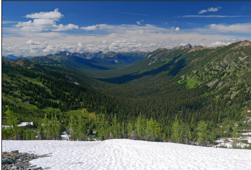
Lynx country in the west fork of the Pasayten River drainage