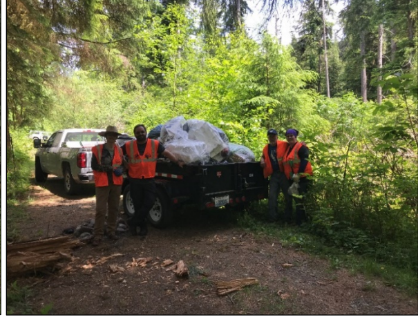
Volunteers with the trailer loaded