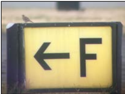
A streaked horned lark observed during survey