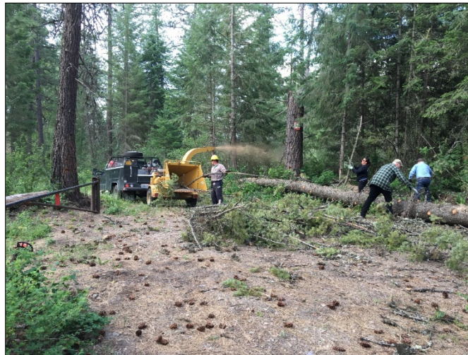
Palmer operating wood chipper at Beaver Creek, with limb removal help from volunteers

Hunter Contacts: Wildlife Biologists Wik and Vekasy responded to numerous hunter calls and emails related to permit hunt opportunities across District 3.