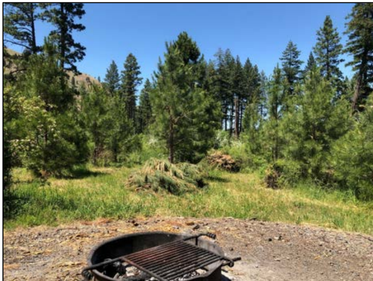
Light thinning around Wooten Wildlife Area campground removed some excess trees, while still providing screening to neighboring campsites

Ramsey Forest Restoration Thinning Project Completion: Forester Mize continues to administer this harvesting services contract on the Methow Wildlife Area as thinning activities wind down after seven weeks. All harvest activities are complete with the final deliveries shipped on June 24. Forester Mize conducted a final inspection of the harvest area and all road maintenance on June 27. In addition, forester Mize collected all the ticket books and branding hammer assigned to this project. During the final compliance check, Forester Mize continued to take photos from designated locations to document the transition from pre-harvest to post-harvest conditions.