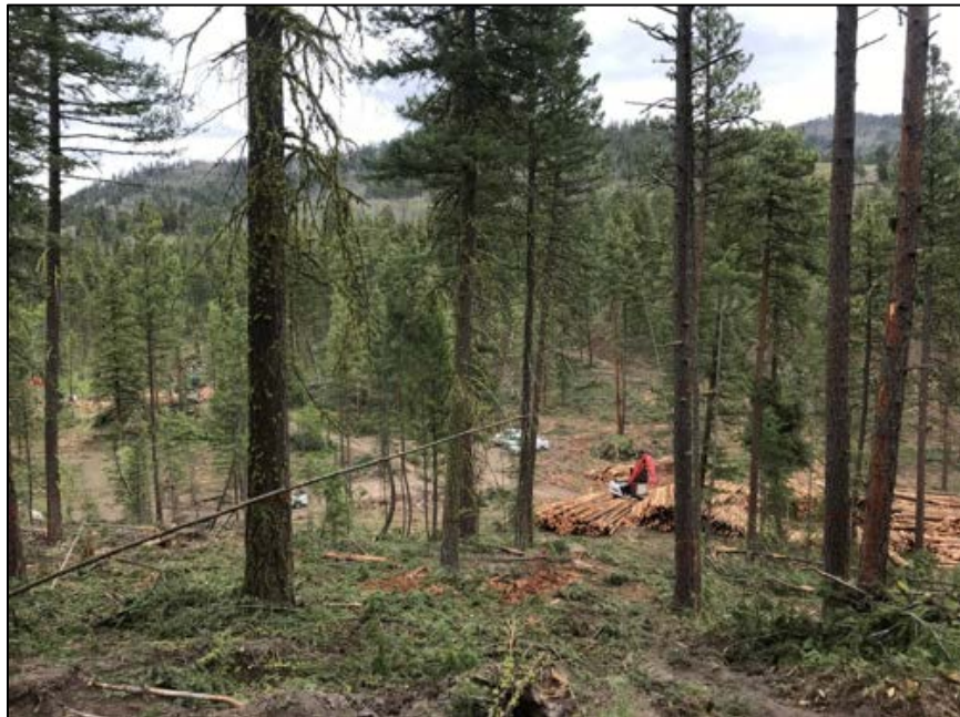
Ramsey restoration thinning photo point two post-harvest condition

Mount St. Helens Thin Completed: Forester Pfeifle did a final inspection of the Mount St. Helens Thinning Project on the Mudflow Unit of the Mount St. Helens Wildlife Area on Monday, June 24. Work on the project began last summer, took a break for the winter, and resumed in late March of this year. The contractor fulfilled all contractual obligations and will be purchasing grass seed for abandoned roads to complete the sale closeout process. The purpose of the project was to thin over-stocked Douglas-fir industry plantations that are approximately 40 years old, releasing dominant trees in the stand to accelerate the growth of residual leave trees.