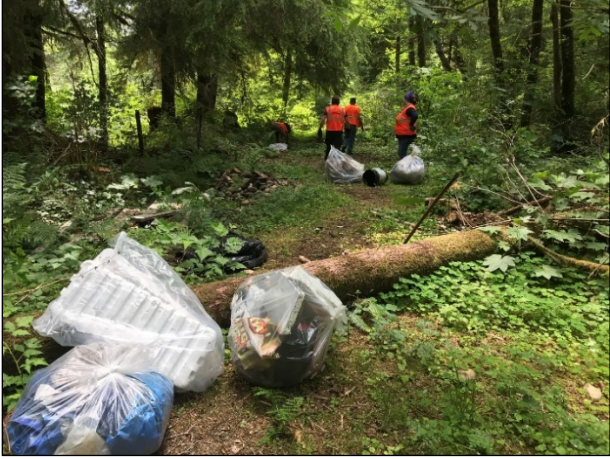
Cleaning up remote campsite