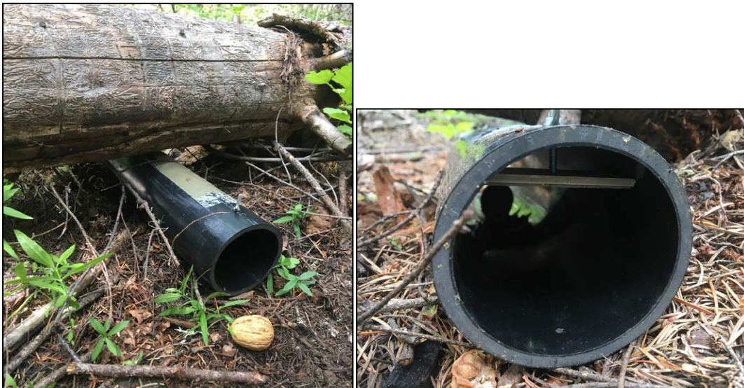
Baited transect tubes – ready for a squirrel!

Western Gray Squirrel Statewide Survey: Over the past two weeks, Wildlife Biologists Wickhem and Bergh and Habitat Biologist Johnson have worked on deploying western gray squirrel transects throughout Klickitat County as part of the statewide survey. Each transect consists of 12 PVC tubes with a walnut glued into each tube, and plates with double-sided tape at each tube entrance. When a squirrel enters the tube to investigate the walnut, it leaves hair behind on the double-sided tape. The hair is used to identify the species of squirrel. Once the transects are deployed, they will be checked for activity three times over the course of two months. The team has 60 transects to complete in Klickitat County by the end of next summer. The results of this study will advise the periodic status review of this state threatened species. For more information about western gray squirrels, please visit: https://wdfw.wa.gov/species-habitats/species/sciurus-griseus .