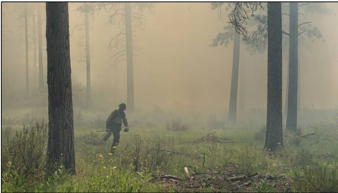
Burning the final acres on the Bear Creek Rx Burn Unit