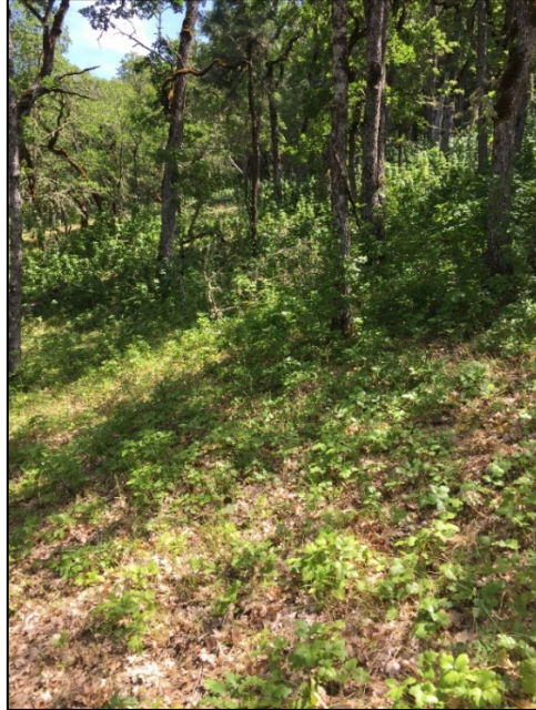
Vigorous Oregon white oak (and poison oak) understory in Oregon white oak woodland, Wide Sky Canyon, Fisher Hill Unit

Blue Mountains Wildlife Area Complex Grazing Monitoring: Range Ecologist Burnham monitored long-term plots on a grazing permit on the Weatherly Unit. This permit will also be up for potential renewal, next year.