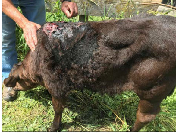
Injuries to the top of the back and side of the calf, inflicted by a black bear