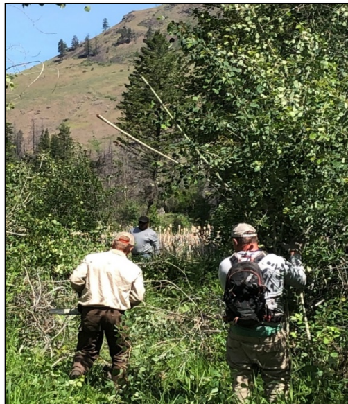
Crew clearing the Coulee Creek trail route

Coulee Creek Trail: The Coulee Creek trail begins at the Hess Lake parking area on the Scotch Creek Wildlife Area and runs north for 7.5 miles to Fish Lake on the Sinlahekin Wildlife Area. The Coulee drainage burned in the Okanogan Complex fire in 2015, and then followed by three years of extremely high water flows through the canyon has prevented us from maintaining the trail. This year the conditions moderated and the crew at Scotch Creek spent this week clearing the route of excess trees, shrubs, grass and weeds (including a flush of poison ivy). The trail route only climbs 300 feet in the 7.5 miles, making it an easy walk or bike ride. Many on horseback also enjoy this route.