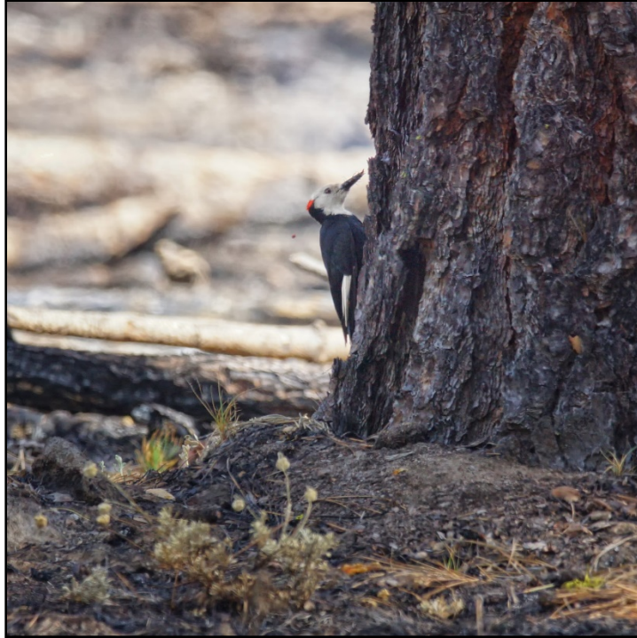
White-headed woodpecker foraging after the Bear Creek prescribed burn

Coulee Creek Trail: The Coulee Creek trail begins at the Hess Lake parking area on the Scotch Creek Wildlife Area and runs north for 7.5 miles to Fish Lake on the Sinlahekin Wildlife Area. The Coulee drainage burned in the Okanogan Complex fire in 2015, and then followed by three years of extremely high water flows through the canyon has prevented us from maintaining the trail. This year the conditions moderated and the crew at Scotch Creek spent this week clearing the route of excess trees, shrubs, grass and weeds (including a flush of poison ivy). The trail route only climbs 300 feet in the 7.5 miles, making it an easy walk or bike ride. Many on horseback also enjoy this route.