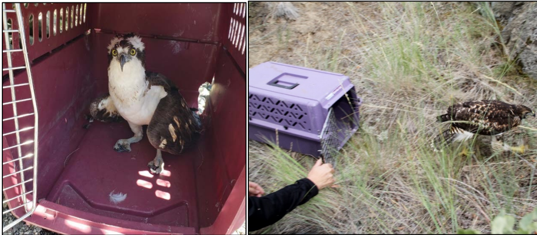
Two birds not really in need of being rescued. Adult osprey (left) Juvenile red-tail hawk (Right)