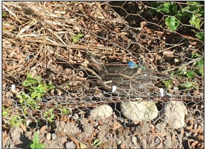
Female Western pond turtle found looking for holes in the fence line