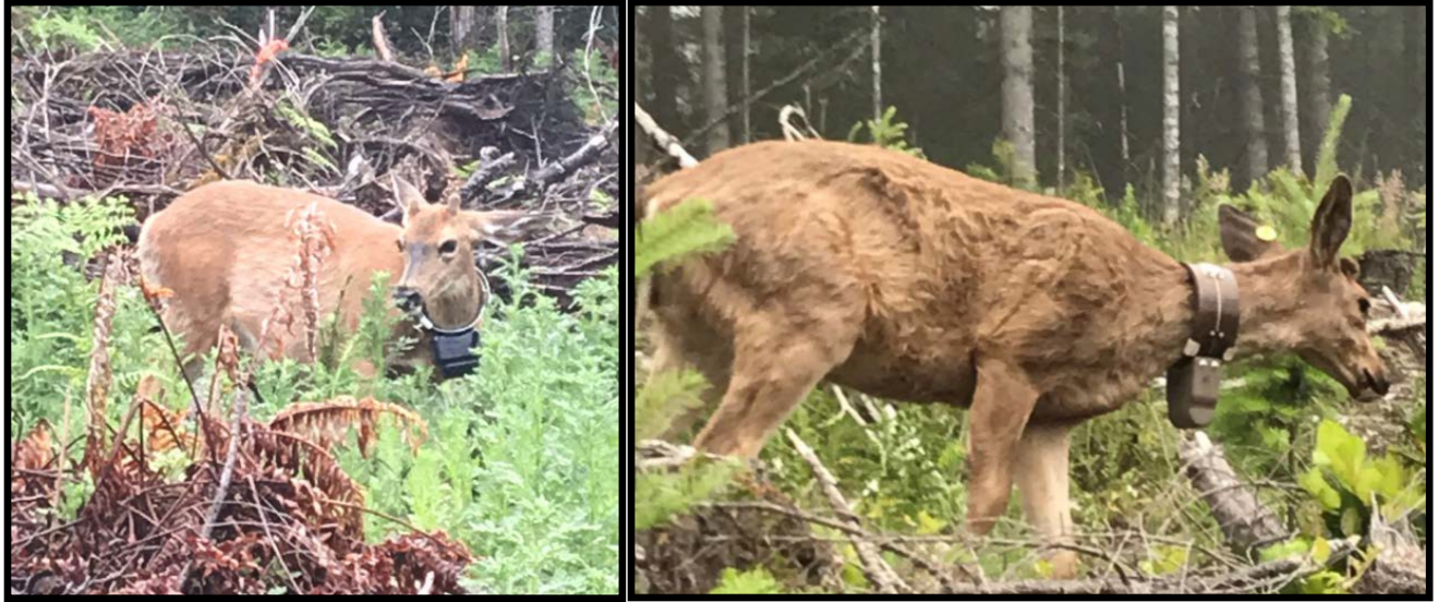
Blacktail bucks captured and collared in GMU 568 (Washougal)