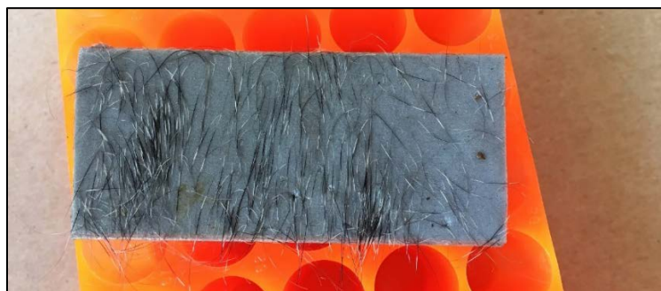
Positive hair sample from a western gray squirrel survey tube