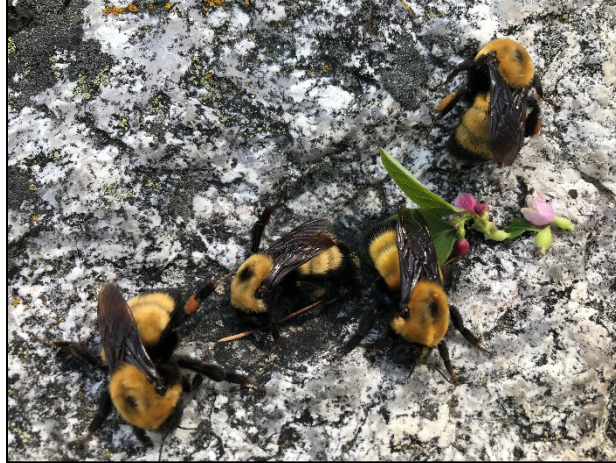
A group of Bombus nevadensis queens before release