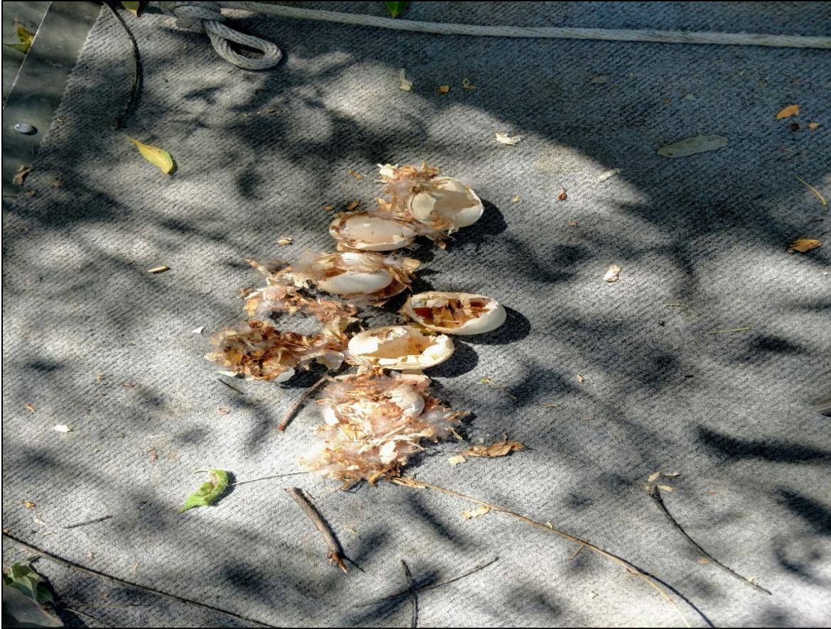
Hatched wood duck eggs - Photo by C. McPherson