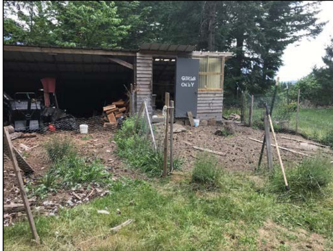
Chicken coop with low fence where chicken was taken by a cougar. The feathers in the bottom left corner of the photo indicate where the chicken was killed.