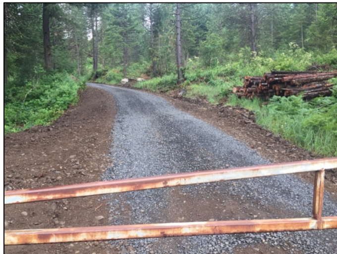
New gravel laid down by WDFW engineers