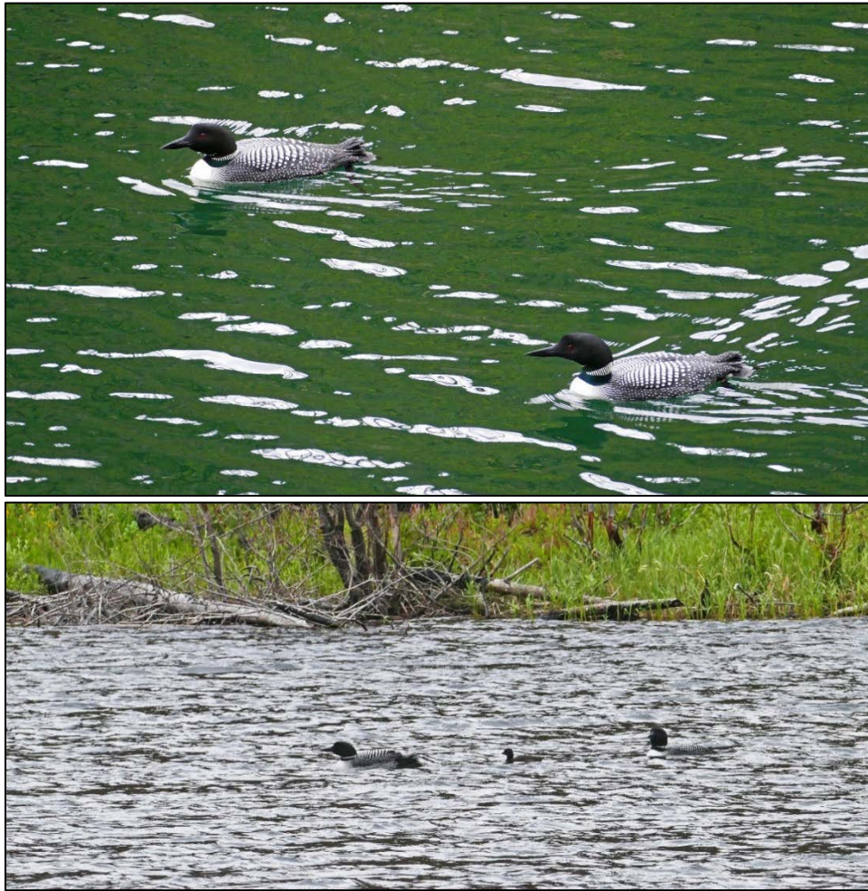
From top: Common loon pair and common loon pair with a chick