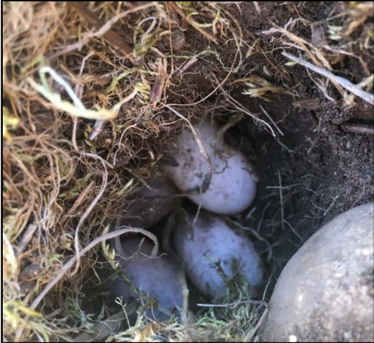
Western pond turtle eggs within nest