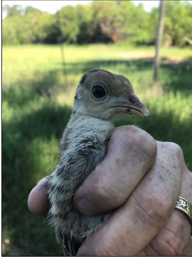
Wild turkey chick freed from wire and released

District 8 Wildlife Conflict Specialist Wetzel was contacted several times about a cougar that was seen in the lower Manastash. No conflicts have been documented between this cougar or cougars to date with humans but a cattle owner removed some cattle from the area due to instances where cattle broke through fences, allegedly from a cougar interaction.