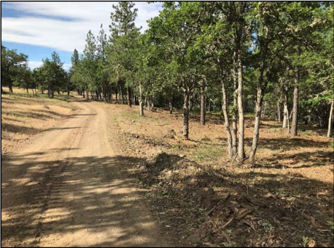
Ground along Old Headquarters Road cleared of limbs and brush to help with fire control