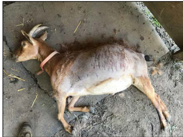
Dead domestic goat killed by a canine. Injuries to the goat's side were visible after shaving the hide.