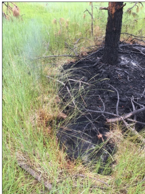
Lightning struck tree still smoldering after a storm

4-O Ranch Wildlife Area Field Inspections: Biologist Woodall and 4-O Ranch Wildlife Area Permittee Doug Jones looked at a field restoration project to come up with a plan to get the Stucker Field out of the weeds and more functional for wildlife and lease operations. They looked at other fields the lessee is managing. They also came across a lightning struck tree that was still smoking. They dug a line around the tree and called DNR firefighters with its location. WDFW engineers had been there recently smoothing the road, adding water runoff drainage, and putting gravel on the road.