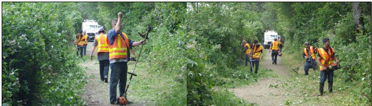
Department of Corrections Work crew helping with clearing the trail around Kress Lake

Kress Lake: Access Manager Rhodes coordinated with the Department of Corrections work crew to pick up trash and start clearing the trail around Kress Lake involving brush and brier cutting.