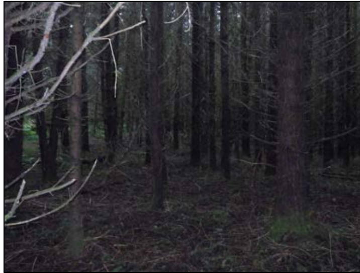
Forest prior to thinning in 2016

This in turn will lead to a healthy mature forest that will eventually develop into a late successional forest condition that is severely underrepresented in the area. Additionally, small five to 10 acre patch cuts were created in red alder dominated groves to improve browse production on the wildlife area. Thanks to everyone who helped to make this another successful forest restoration project.