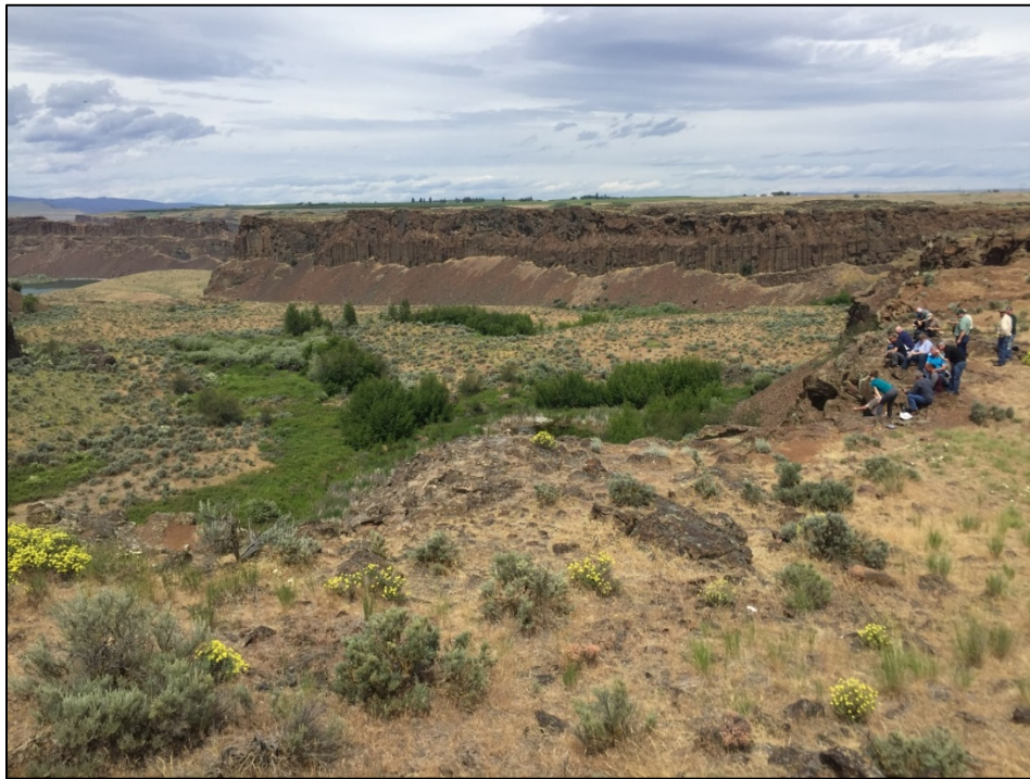
Lunchtime with a view; senior staff meeting at Quincy Lakes Unit