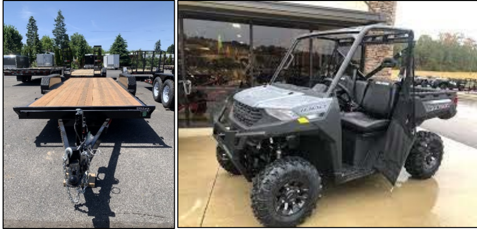
Actual trailer (left) and example of Polaris Ranger 1000 (right)

Natural Resources Conservation Service Training: Private Lands Biologist Thorne Hadley participated in a Conservation Reserve Program (CRP) Suitability and Feasibility Worksheets webinar hosted by the Natural Resources Conservation Service.