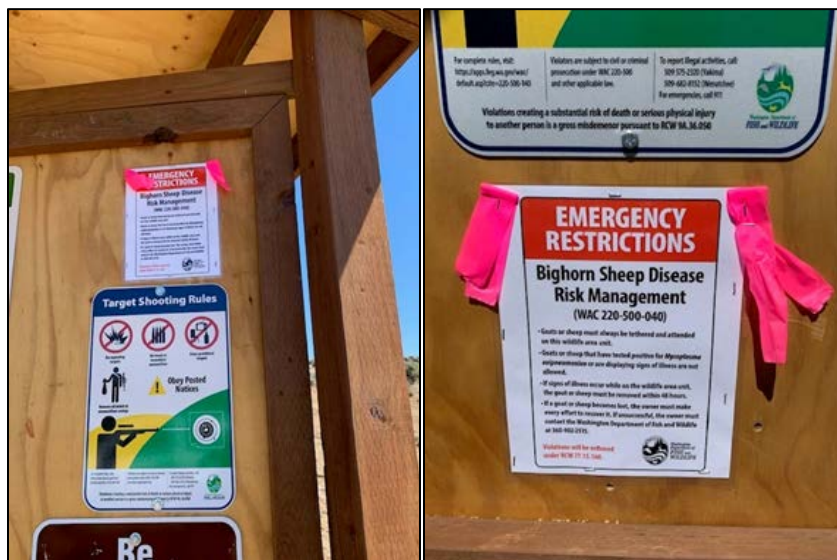
Emergency Restriction signs restricting domestic grazing in proximity with Bighorn Sheep

L.T. Murray Wildlife Area Natural Resource Technician Blore put up signs at Pump House and Corrals access areas to alert the public to new emergency restrictions that prohibit grazing domestic sheep and goats in these areas untethered or unattended.