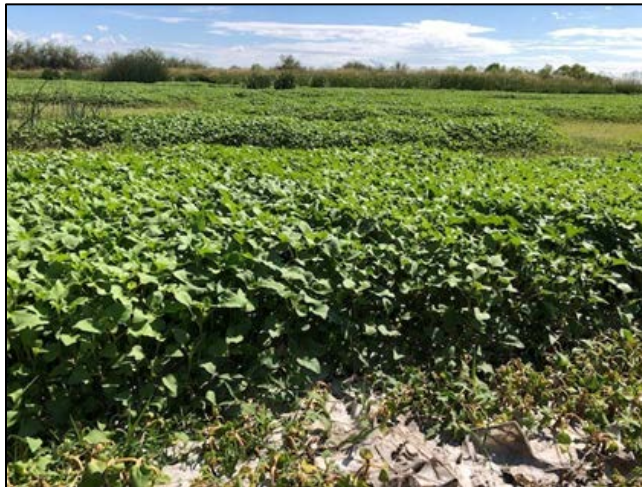
Cocklebur prior to herbicide application