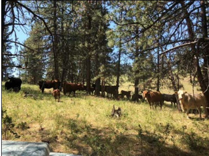
Part of the herd of cattle escaping the summer heat in the shade

4-O Wildlife Area Grazing Allotment West: Wildlife Conflict Specialist Wade and Wildlife Area Manager Dice spent a day touring the 4-O Wildlife Area west allotment. Dice showed Wade multiple interior pastures and access trails. Wade and Dice observed cattle currently grazing on the western allotment. They both contacted the permittee after observing several calves that appeared to be under the weight requirement and a small herd cattle that were observed in the wrong pasture. Wade recommended that the producer install/maintain cross fencing to aid in keeping cattle better grouped up and discussed the complications of having underweight calves in the area.