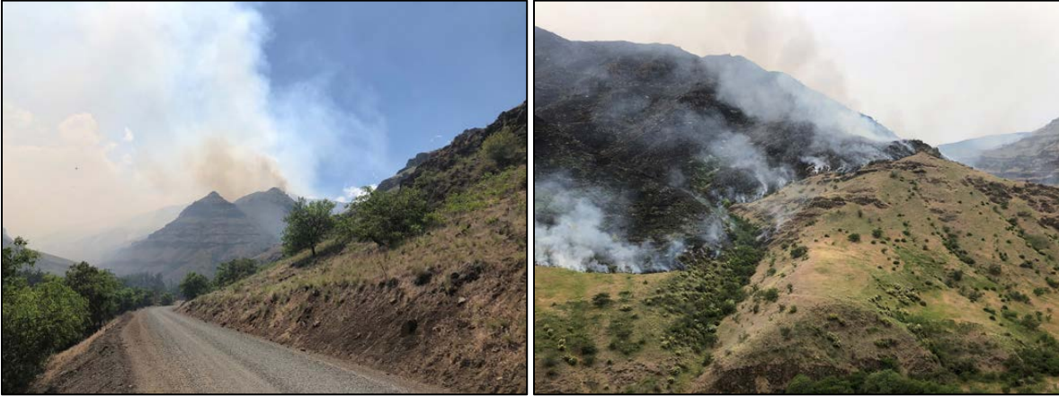
Joseph Canyon Fire (left) and WDFW lands burning on the south side of Joseph Creek (right)