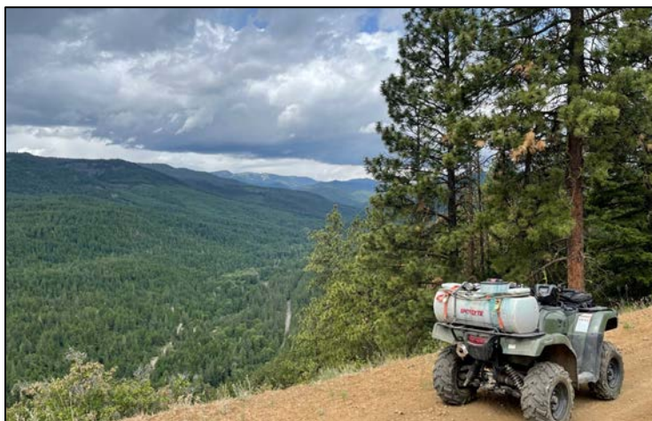
Morrison Road overlooking Taneum Canyon

L.T. Murray Wildlife Area Assistant Manager Winegeart chemically treated weeds on Moonlight and Morrison roads in Taneum Canyon.