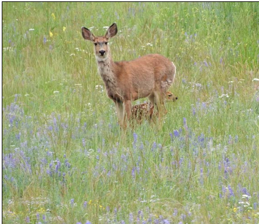
Mule deer doe with fawn stand in SAFE CRP field that burned in Pearl Hill Wildfire last Summer. As you can see, recovery has been good!