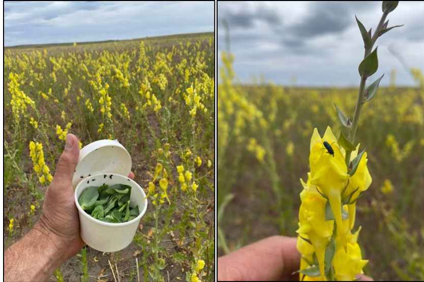
Mecinus jathinformis Stem boring weevils released to assist in controlling noxious weed Dalmatian Toadflax which has bolted after Pearl hill Wildfire in Douglas County