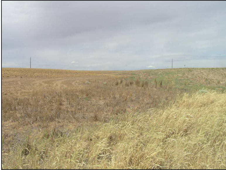
Spray tractor tracks in draw near CRP