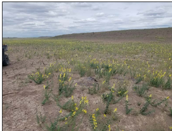
Dalmatian toadflax in general CRP where biocontrols were released

Post Fire Habitat Restoration: Biologist Hughes worked with USFWS on developing a contract for a habitat project they are doing together in the Beezley Hills. The project will be enhancing a full section that burned in 2017. The native grasses and forbs in the area have come back extremely well after the burn. There is room to enhance the habitat by planting shrubs. Historically, this site has never been farmed and was previously grazed over 20 years ago. Hughes received a Partners Fund grant for planting sagebrush from USFWS. Additionally, Hughes is contributing other shrubs from Hunter Access and habitat funds. The landowner has been enrolled in the Hunter Access Program for over 15 years. Hughes reached out to the landowner and went over the project proposal and the contract to be signed that is tied to the partners funds. The landowner is excited to have habitat work done on his property. The project is focused on pygmy rabbit recovery and will also benefit mule deer and upland birds.