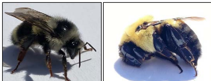
Two-form bumblebee (left) and Suspected eastern bumblebee (right) – Photos by Sean Dougherty

PNW Bumblebee Atlas: Biologist Dougherty with the assistance of Biologist Grabowsky surveyed four Graves bumblebee survey cells to document presence and species richness at sites representing different types habitat. Overall, the effort was difficult due to bumblebees being absent from three of the four sites. However, there were 11 bumblebees captured and photographed at the fourth site. Biologists were challenged with the flowering plant identification and taking “good” photos of immobile bees. For more information check out the Pacific Northwest Bumblebee Atlas project.