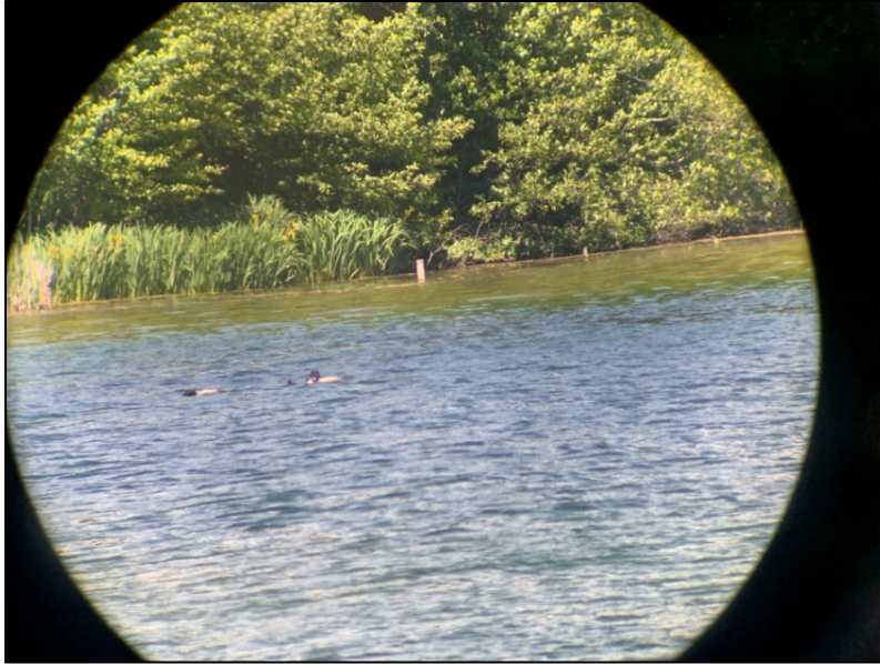
Two adult and two loon chicks seen through a poorly framed spotting scope picture