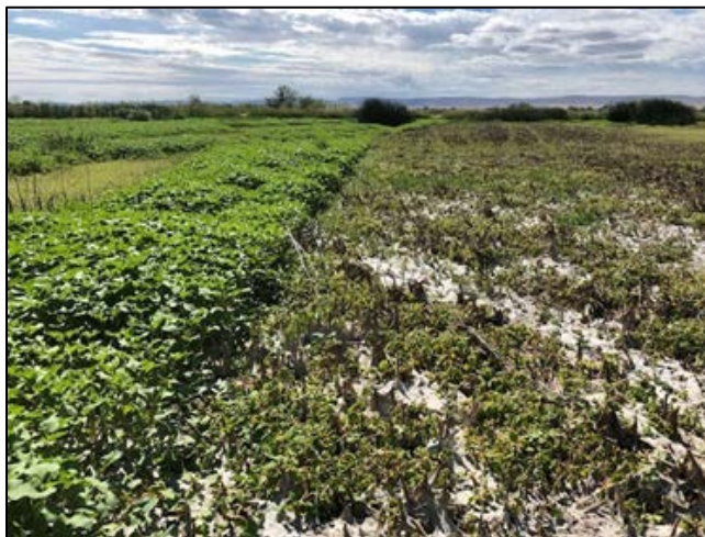
Additional picture of before herbicide treatment and after treatment