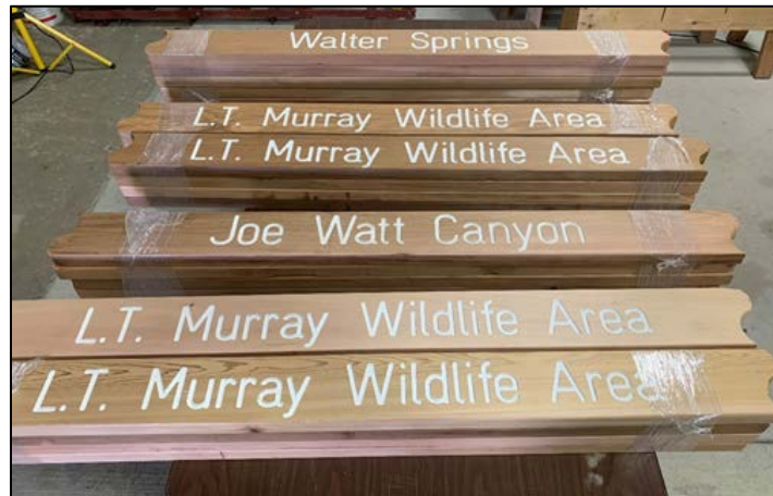
Location information banners created by Selah H.S. students