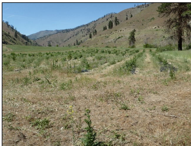
2013 Swakane Canyon Planting in 2014

Swakane and Chelan Butte Units – Riparian Restoration: Over the past eight years, fourteen riparian plantings totaling eleven acres have been completed on the Chelan Butte and Swakane Units with funding from the Chelan Public Utility District Rocky Reach Dam Settlement Agreement. In 2019, a one-acre planting was completed on Chelan Butte and two acres were completed in Swakane Canyon in 2020. It is commonly known that riparian areas provide habitat for a plethora of native mammals and birds and introduced game birds. This habitat type is also important to beneficial insects and pollinators. Shrubs that flower at different times during the growing season provide a more continuous source of needed pollen and nectar. Flowering shrubs that were planted include: smooth sumac, serviceberry, chokecherry, woods rose, hawthorn, Oregon grape, golden current, wax currant, blue elderberry, ocean spray, mock orange, and snowberry. Starting in 2018, all plots have included plantings of narrow-leaf milkweed and showy milkweed.