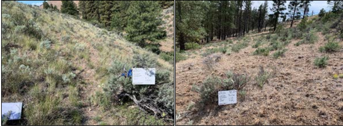
Grazing monitor site on north aspect hillside (left) and grazing monitor site on south aspect hillside (right)