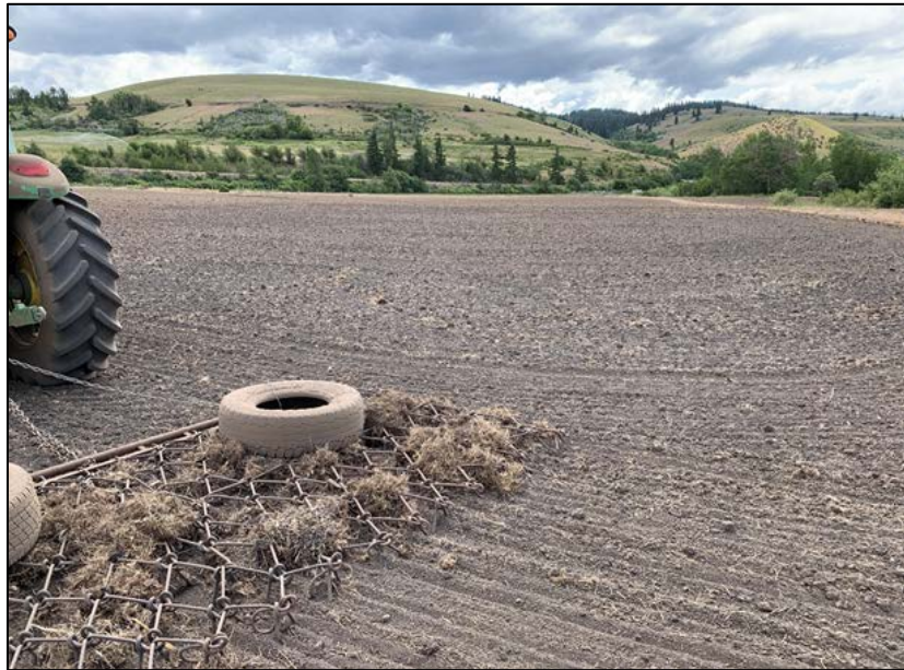
Natural Resource Specialist Nass harrowed the 6-acre parcel in the L.T. Murray WLA as part of the restoration efforts to return historic pasture to native habitat

Colockum Wildlife Area staff members met with WDFW Forester Mize to look at timber stands that were inventoried last year for possible timber stand improvement projects. Many of these stands are heavily overstocked, resulting from many years of fire exclusion, and they are greatly departed from a more natural, historic condition.