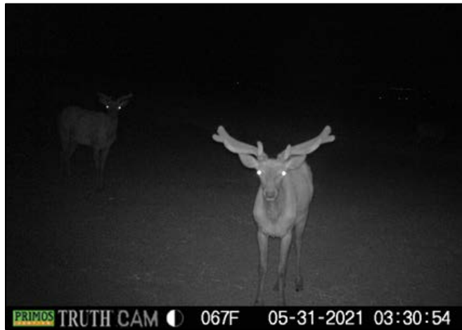
Last picture from a damaged trail camera

Rattlesnake Hills Trail Cameras: District 4 Wildlife Conflict Specialist Hand checked and maintained two trail cameras deployed in areas on Rattlesnake Mountain that elk have historically used to leave the Hanford Monument for winter wheat crops. One camera was removed after being heavily damaged by curious elk.