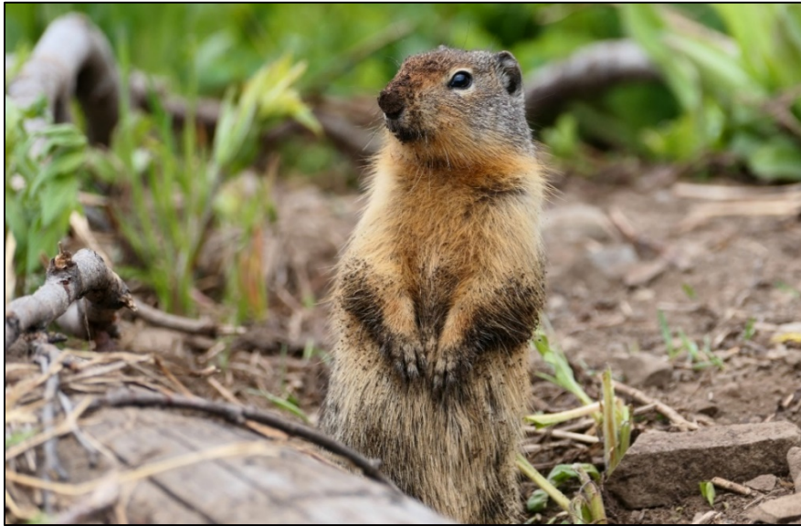
Columbia ground squirrel