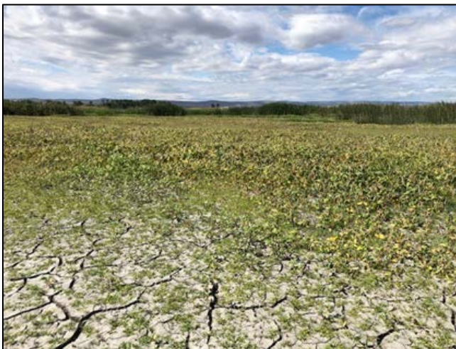
Cocklebur after herbicide application