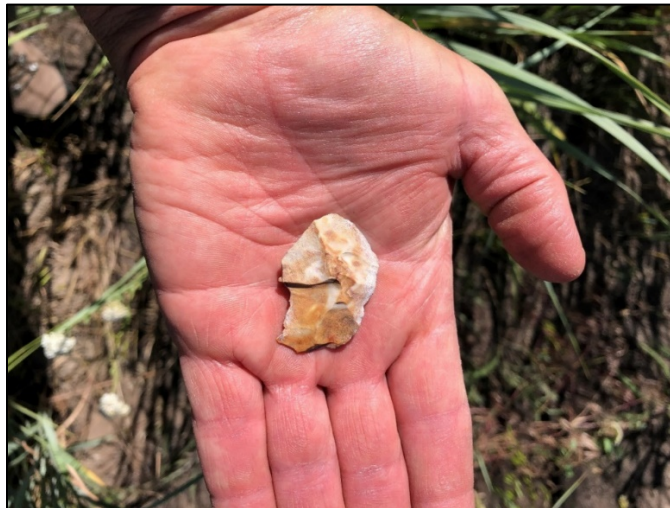
A flake is found