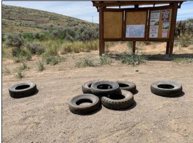
Natural Resource Technician Blore removed a pile of tires from the Corral parking lot

Natural Resource Technician Blore removed a pile of old tires that were dumped in the Coral parking lot.