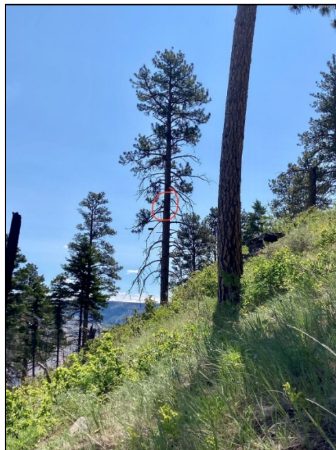
Lewis’s woodpecker nest cavity tree

Cavity Nester Surveys: Biologists Comstock and Jeffreys completed the final woodpecker surveys for the year in the Mills Canyon area. Biologist Comstock confirmed the location of an active Lewis’s woodpecker nest cavity in a ponderosa pine tree, but no new nesting pairs of Lewis’s woodpecker or white-headed woodpecker were detected.