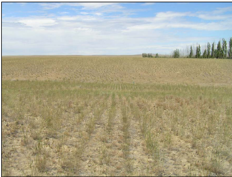
CRP with mostly crested wheat grass

Ground Squirrels: District 8 Wildlife Biologist Bernatowicz picked up a road-kill ground squirrel from a cooperative landowner in the Wenas Valley. The finding was noteworthy, as no ground squirrels were found on historic sites in 2020. A sample for DNA was collected and sent to Olympia.