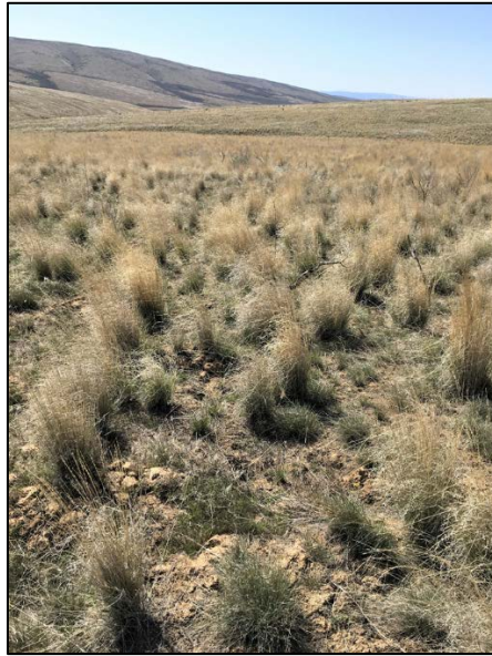
Native bunchgrasses developed after 2017 burn

Swakane and Chelan Butte Units – Riparian Restoration: Over the past eight years, fourteen riparian plantings totaling eleven acres have been completed on the Chelan Butte and Swakane Units with funding from the Chelan Public Utility District Rocky Reach Dam Settlement Agreement. In 2019, a one-acre planting was completed on Chelan Butte and two acres were completed in Swakane Canyon in 2020. It is commonly known that riparian areas provide habitat for a plethora of native mammals and birds and introduced game birds. This habitat type is also important to beneficial insects and pollinators. Shrubs that flower at different times during the growing season provide a more continuous source of needed pollen and nectar. Flowering shrubs that were planted include: smooth sumac, serviceberry, chokecherry, woods rose, hawthorn, Oregon grape, golden current, wax currant, blue elderberry, ocean spray, mock orange, and snowberry. Starting in 2018, all plots have included plantings of narrow-leaf milkweed and showy milkweed.