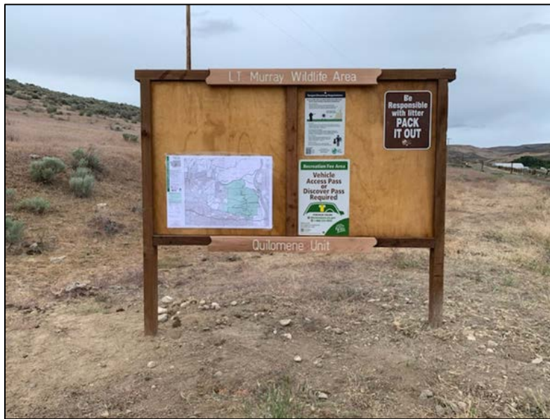
Newly installed Parke Creek kiosk