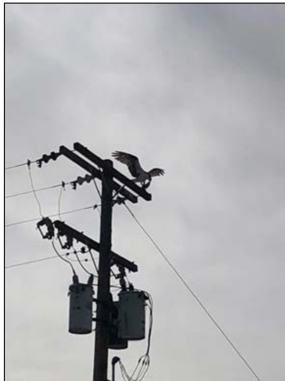
An Osprey feeds on a carp