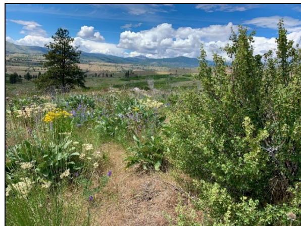
Near a monitoring plot for a grazing permit on the Chiliwist Wildlife Area

Ecological Integrity Sampling: Range Ecologist Burnham conducted long-term/ecological integrity monitoring on the Chiliwist, Sinlahekin, and Chesaw Wildlife Areas.