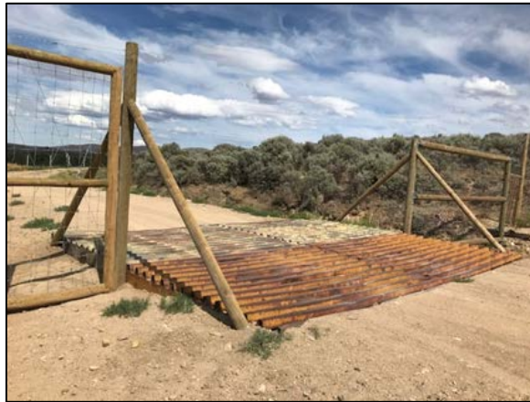
New elk guard and return gate