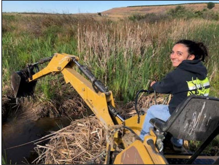
Trina striking a pose while operating the skid steer backhoe

Sunnyside Wildlife Area Natural Resource Technician Wascisin sprayed Kochia and other broadleaf weeds recently at the Vance Ferry Unit Access site. Wildlife Area staff members will finish herbicide applications in the next few weeks and will transition to mowing as nesting season comes to an end.