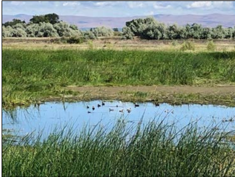
An assortment of teal located within the Johnson wetland

Sunnyside Wildlife Area Manager Kaelber recently observed many species of waterfowl and shorebirds using the receding water within the Johnson wetland. The shallow water provides foraging opportunities by providing newly emerged plants and macroinvertebrates. The area pictured below will slowly dry and the dense vegetation will be mowed prior to fall reflooding.