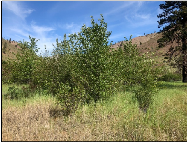
2013 Swakane Canyon Planting in 2020

Big Bend Wildlife Area – Shrubsteppe Restoration: Sidra and Marco continue to work long days on two shrubsteppe restoration projects at the Big Bend Wildlife Area. They completed spraying the 150-acre Bissell Flat site then moved up the road to the 180 acre Back Rock site. Part way through the process, issues with our tractors necessitated them borrowing tractors from the Colockum Wildlife Area and the Swanson Lakes Wildlife Area – which meant lots more driving around than anticipated. Fidel, Marco, and Dan mowed roads on all units. Total mileage over two or so weeks was upwards of 70.