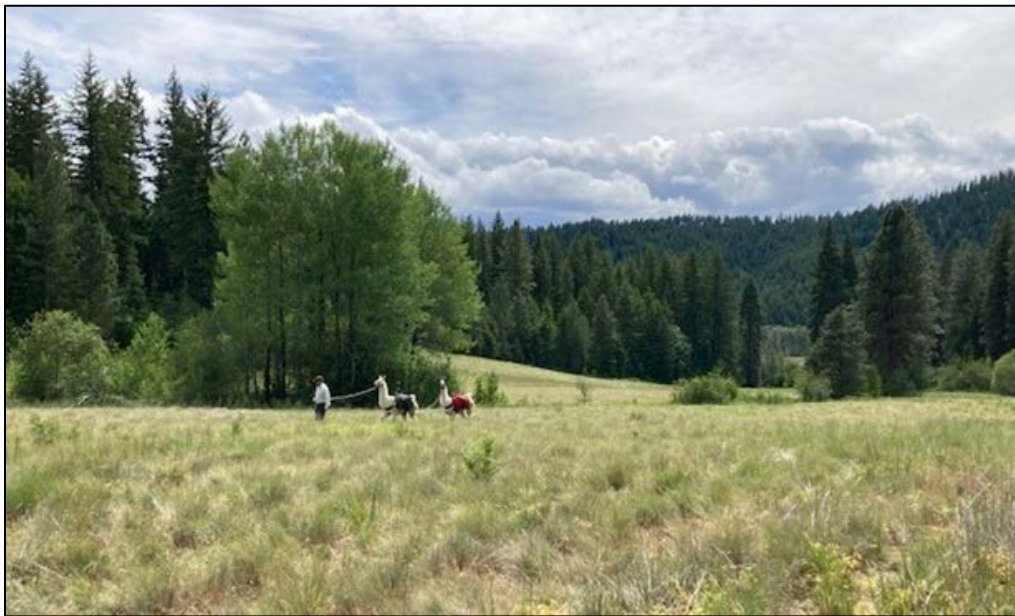
Teaway neighbor and his pack of llamas