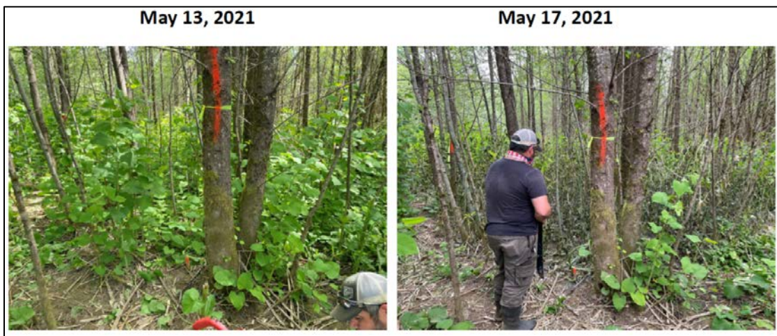
Before and after photos of the Satsop high rate