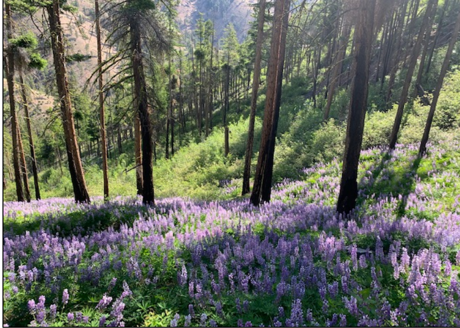
Lupine carpets the forest floor in one of the Mills Canyon cavity nester survey grids