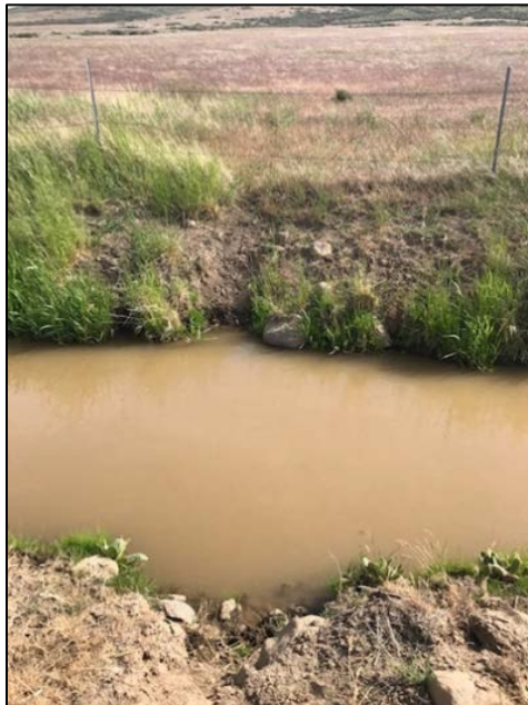
Elk trail in one of several fields

Yakima County: Two orchardists in the Naches River area between Naches and Yakima called to report elk using their orchards. The locations were several miles apart and elk numbers were in the 10-20 range, with both bulls and cows present.