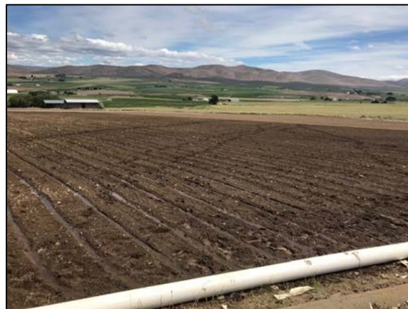
Elk tracks in new seedings

Kittitas County: District 8 Wildlife Conflict Specialist Wetzel attempted to haze elk in the Badger Pocket area. Elk use of the agriculture fields is steadily increasing in frequency and numbers of elk are going up. Hay growers are calling from the north, east, and south areas of the area. Elk are easily seen on the Yakima Training Center (YTC) and do not travel very far into the installation. Military training has limited access to haze the elk further onto YTC. Most of the elk are bulls, though cow numbers have been increasing this month.