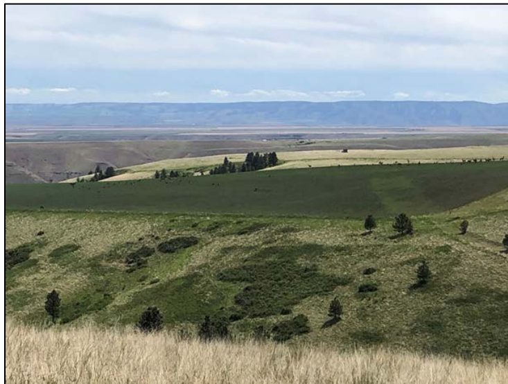
A typical scene on annual crop fields at Smoothing Iron Ridge: elk munching on winter wheat

Asotin Creek Wildlife Area Elk: As in previous years, elk are congregated on green annual crop fields at Smoothing Iron Ridge. Repairs by a local electrician were recently completed to the water system enabling us to begin filling storage cisterns and water troughs. We anticipate a dry summer meaning the troughs and other water developments will be critical to elk as summer progresses.