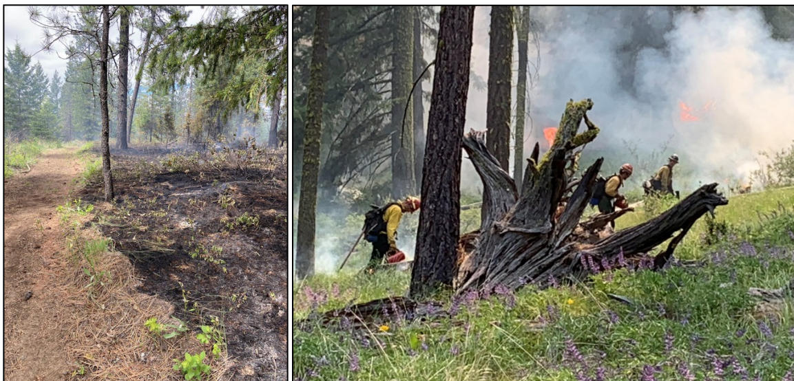
Prescribed Fire at Rustler’s Gulch (left) and Oak Creek Cougar Canyon (right)