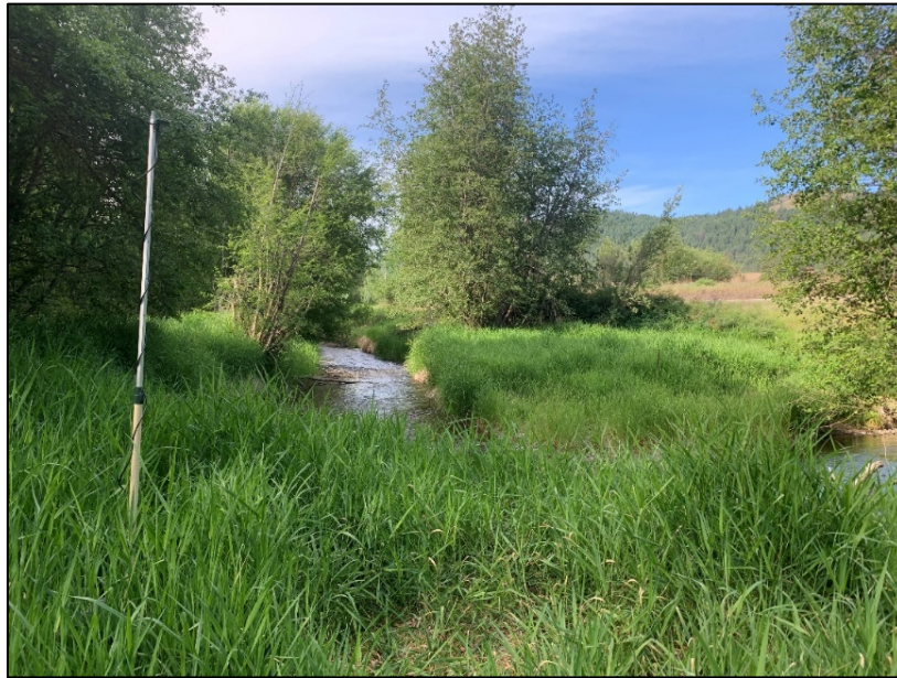
An acoustic bat detector setup by a creek