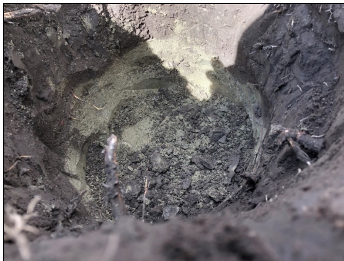
Mazama ash layer below site loam