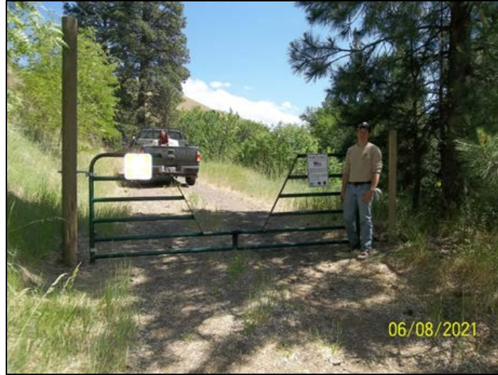
Horse access gate at Cumming Creek on the Wooten Wildlife Area - Tom Jensen is pictured near the gate