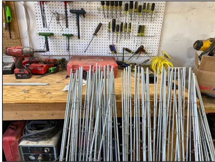
Fiberglass fence stays being outfitted with metal clips for wire attachment