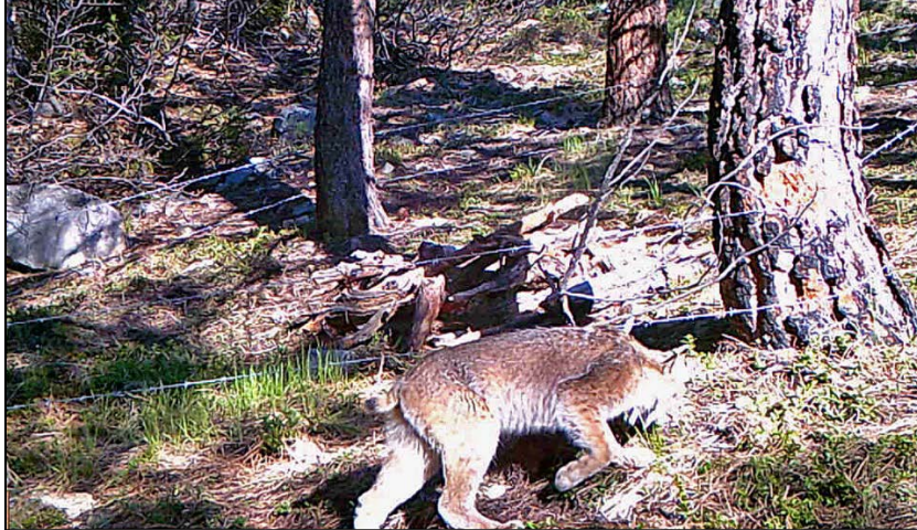
Lynx visiting a bear hair-snag site