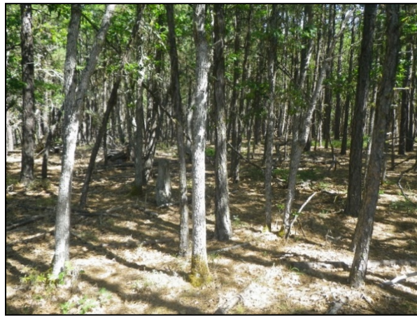
Overstocked forest conditions on the Klickitat WLA vulnerable to wildfire and preventing trees from getting large enough to provide quality western gray squirrel habitat