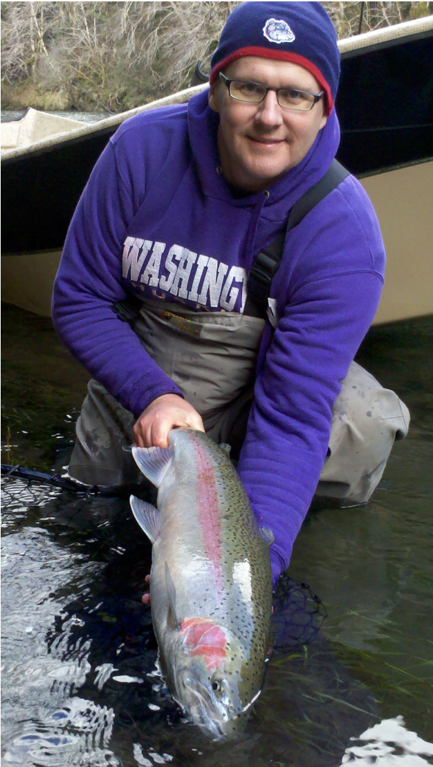
Steelhead caught in Schneider Creek