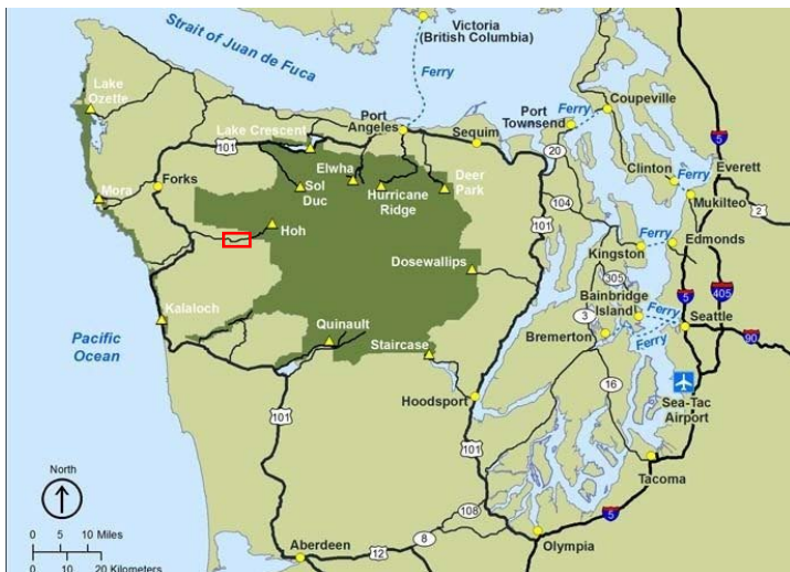
Figure 1. Map of the Olympic Peninsula. Red box denotes the ~7 miles stretch described as the Upper Hoh River from Morgan’s Crossing Boat Launch to the Olympic National Park Boundary.

On March 24, 2021 The Fish and Wildlife Commission received a petition from Ravae and Aaron O’Leary, Angler’s Obsession, requesting that the commission repeal the existing rule established in 2016 in the Hoh River prohibiting fishing from a boat in the upper reach from Morgan’s Crossing Boat Launch upstream to the Olympic National Park boundary below the mouth of South Fork Hoh River (Figure 1). The petitioner is requesting the regulation be changed to allow fishing from a floating device for salmon and steelhead in this approximately 7 miles stretch of river.