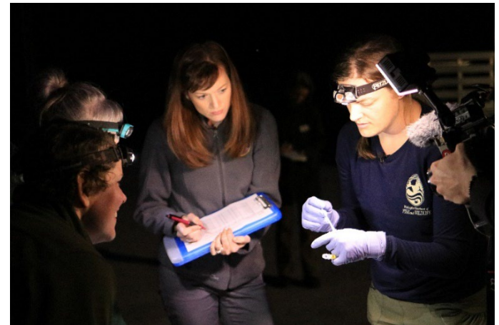
WDFW staff conducting bat testing