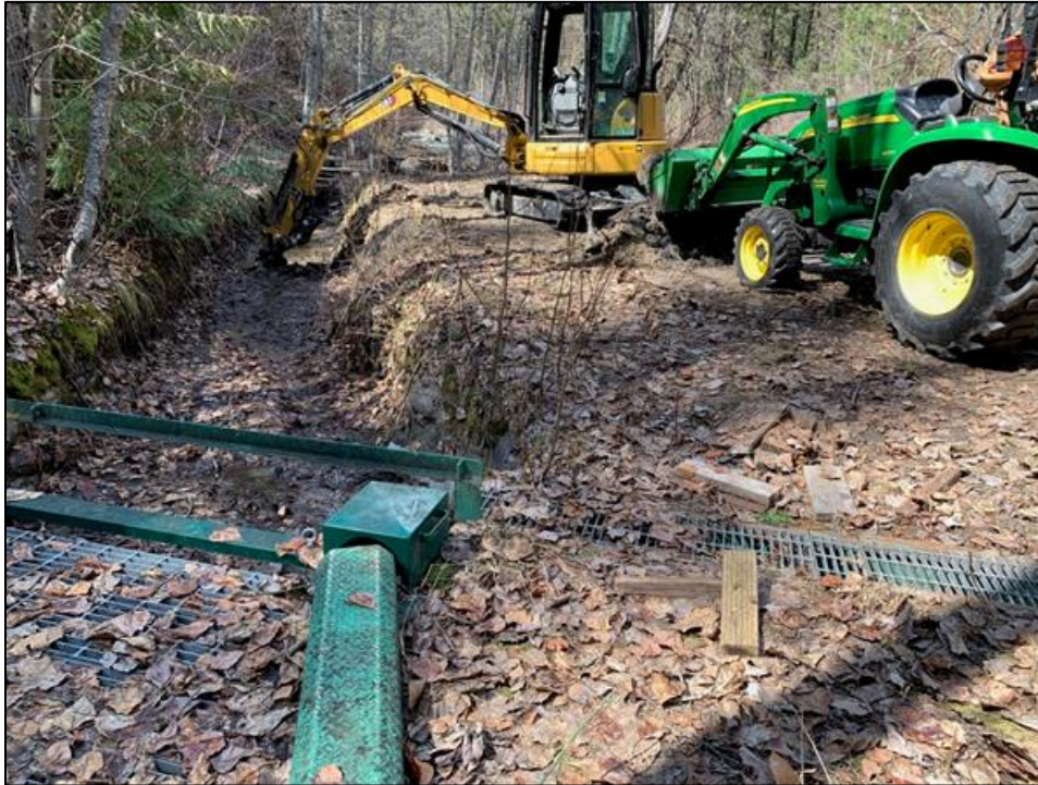
Mini excavator and tractor work to clear a diversion ditch.

Wildlife area staff used Sherman Creek Wildlife Area's mini-excavator, tractor, and additional small equipment on Rustlers Gulch Wildlife Area trails to cut back encroaching brush. Trails near the Beaver Creek Trailhead were the top priority. Staff also cleared roads, trails, and the water diversion access route on Sherman Creek Wildlife Area.