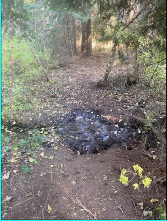
Site for future culvert on Rustlers Gulch Wildlife Area.