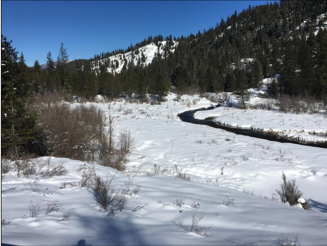
Rustlers Gulch Wildlife Area - part of Sherman Creek Wildlife Area

This document is intended to highlight accomplishments during calendar years 2021 and 2022, as they relate to goals and objectives identified within the Sherman Creek Wildlife Area Management Plan (including Rustlers Gulch Wildlife Area), and LeClerc Creek Wildlife Area Management Plan . The plan addresses the status of wildlife species and their habitat, ongoing restoration efforts and public recreation opportunities at the Sherman Creek Wildlife Area. Every 10 years, the Washington Department of Fish and Wildlife (WDFW) develops a process for revising the management plans for each wildlife area to identify new management priorities and actions. In between plan revisions, the update focuses on recent accomplishments over the last two years.