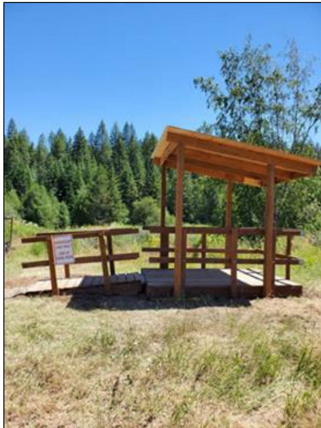
Newly roofed hunter platform, Rustlers Gulch Wildlife Area.

Inland Northwest Wildlife Council members added a roof to the disabled hunter platform located near the Pruffer Barn, located in the southwest portion of Rustlers Gulch Wildlife Area. The protection from rain and sun provided by the roof helps those disabled users with thermo-regulation issues.