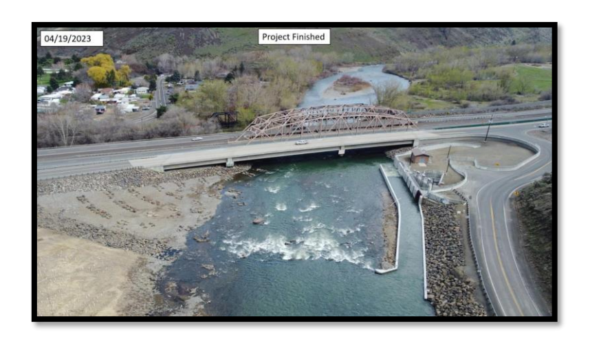
Nelson Dam Removed

Describe what partners or other leaders did that was critical.