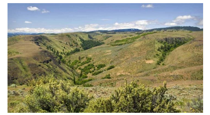
South Fork Cowiche & Shrub Steppe Protected