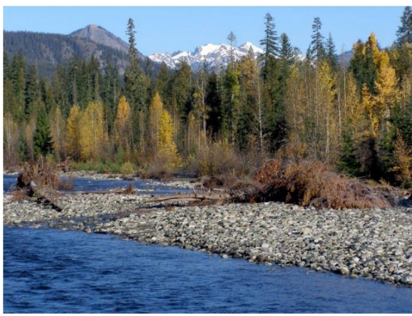
Teanaway River & Forest