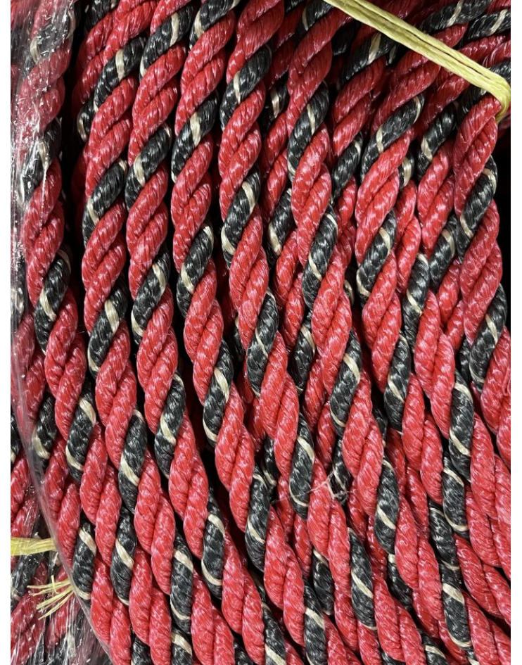
Red and black manufactured line WA Coastal Dungeness Crab

Prohibit the registration and use of a buoy brand required by a treaty tribal fishery [5(d)(v)]