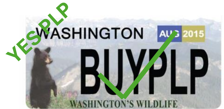
Special Background Plate + Personalized License Plate