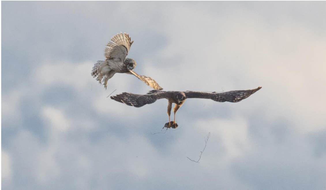
Northern harrier and short-eared owl.