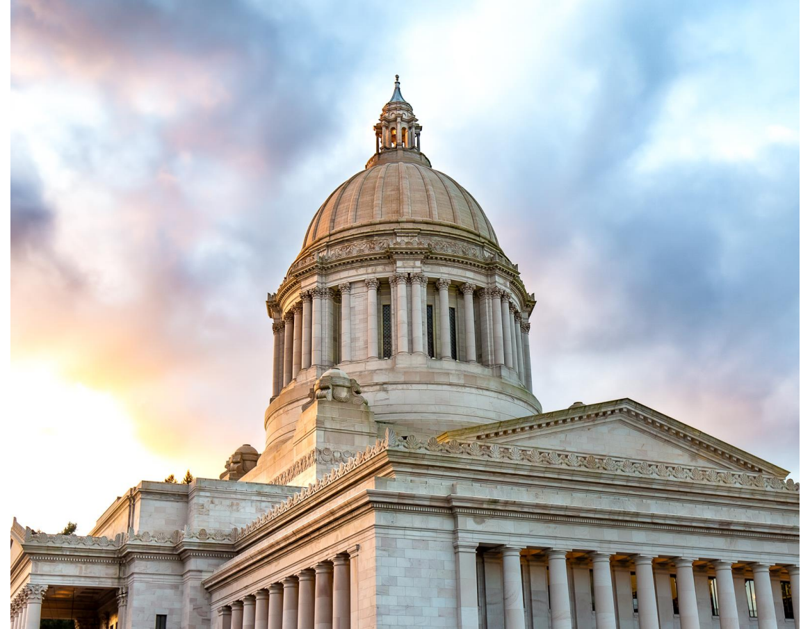
Washington State Legislative Building.