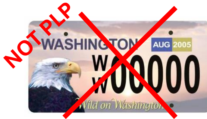
Special Background Plate