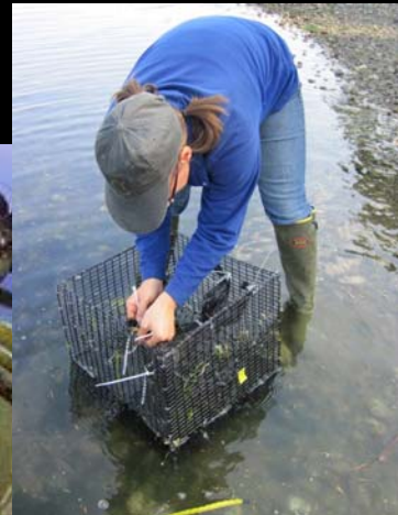
WDFW & Puget Sound Recovery