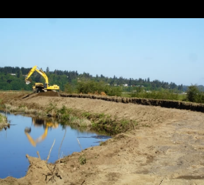
F&W Commission 11/08/12