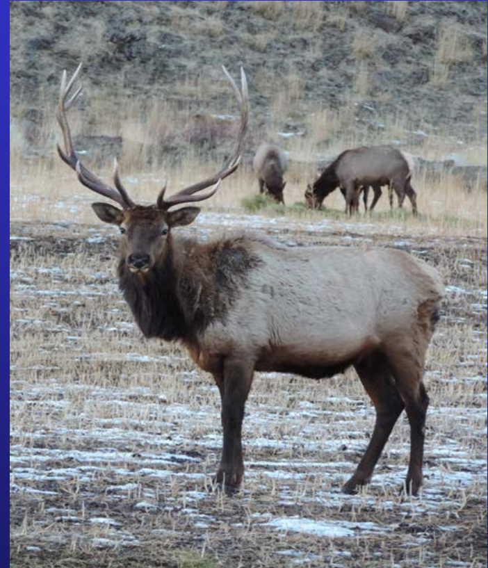
Elk with Hay in the Background