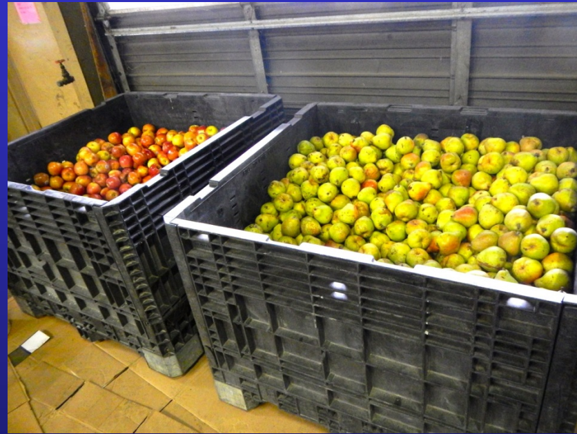
Bins of Fruit Sometimes Used as Bait