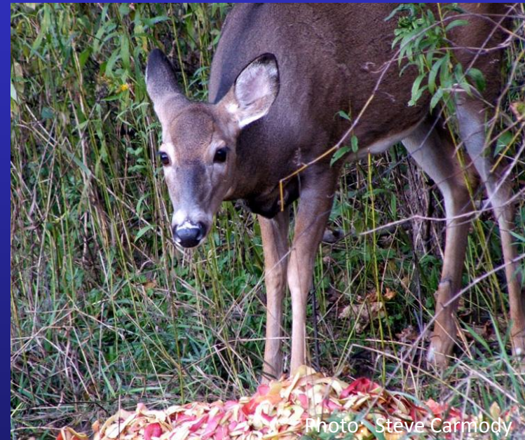
Deer Using an Apple Bait Pile