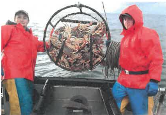
WA Commercial Dungeness Crab Vessel