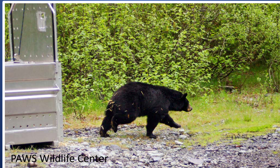
PAWS Wildlife Center