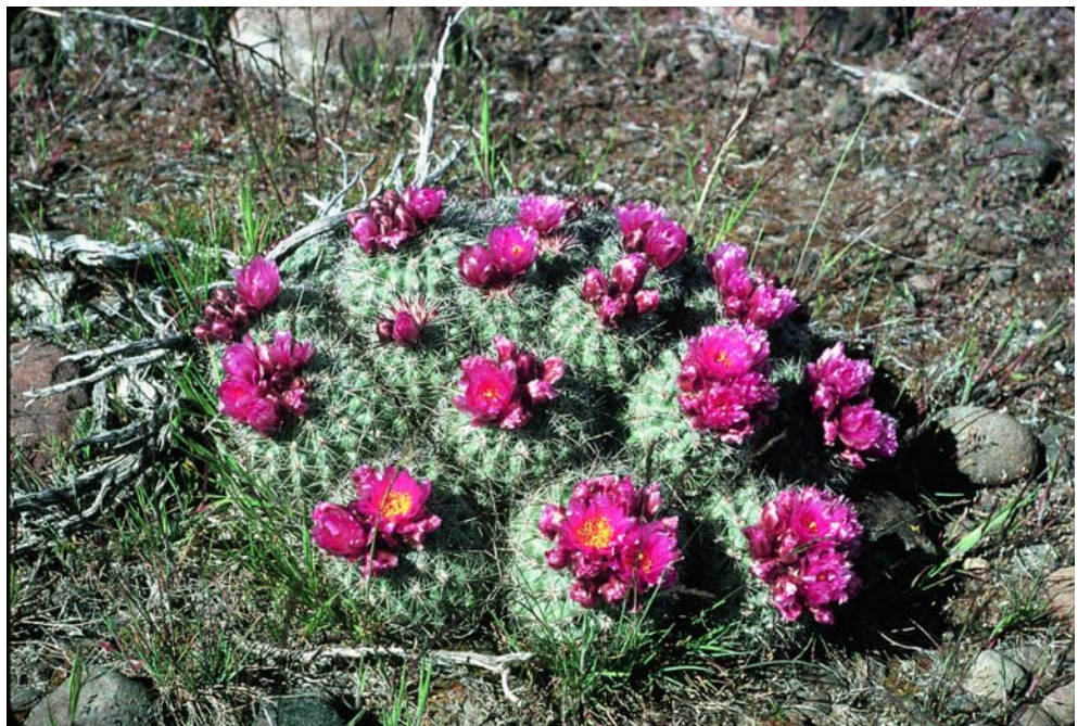
Hedgehog cactus in Shrub-steppe

Shrub steppe – The majority of the arid portions of the Colockum Wildlife Area is comprised of shrub steppe habitat (predominantly sagebrush and/or bitterbrush mixed with various bunchgrasses). Certain portions exhibit some of the state’s best remaining native shrub-steppe communities. This cover type will be significant in WDFW’s future sage grouse restoration efforts.