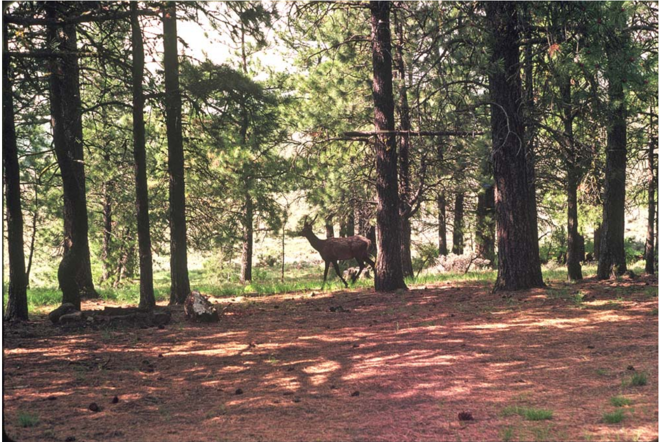
Spike elk wandering old hunting camp

The Colockum Elk Herd plan (2005) is currently in draft with expected completion due in the spring of 2006. Herd objective goals (4275-4725 elk) were laid out in the WDFW's 2003-2009 Game Management Plan (2003) with the Colockum plan providing detailed guidance in herd management. The Colockum Wildlife Area Plan and Colockum Herd Plan will have interactive management to insure both are in alignment. Ensuring habitat protection, habitat enhancement and limiting human disturbance are critical functions the Wildlife Area Manager will have to deal with for both plans to be successful. Specific items needing management actions include: livestock grazing management, vehicle access management, fire protection, management of old agricultural fields and management of the Coffin Reserve etc.