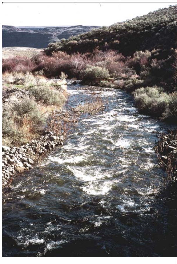
Intermittent Stream: Tekison Creek

Vigorous fire protection, development of ladder fuels, over-stocked tree stands, insects and disease infestations have made timber stands on the Colockum susceptible to stand replacement fires. Over the years, several small fires have broken out on the