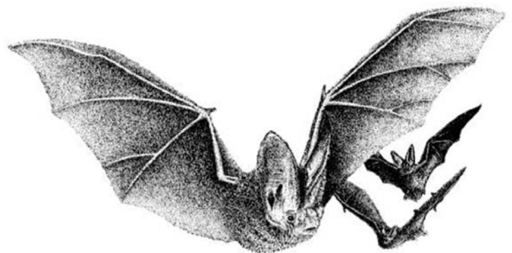
PACIFIC TOWNSEND'S BATS | darrell pruet