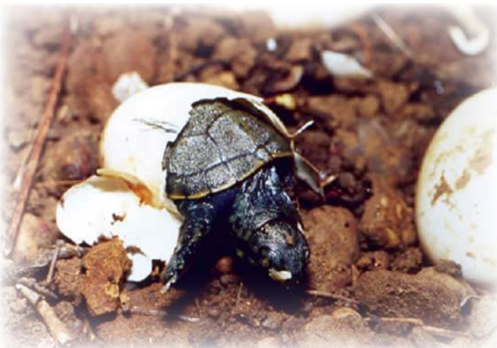
WESTERN POND TURTLE HATCHING | wdfw