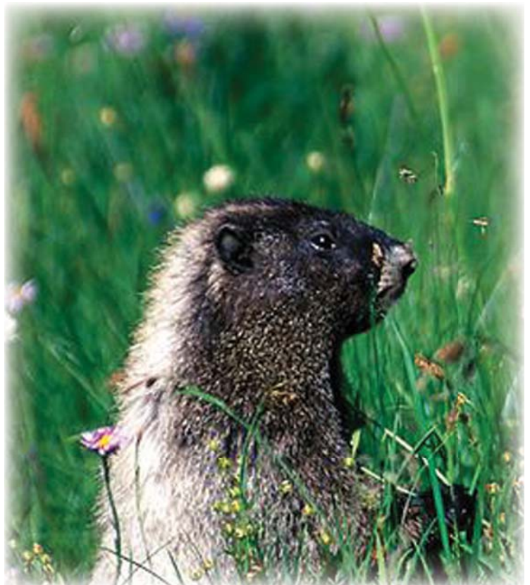
OLYMPIC MARMOT | stephen penland