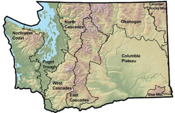
ECOREGIONS OF WASHINGTON | wa dept. of natural resources

Ecoregional assessments (EAs) address species and habitat conservation targets and map biodiversity for each of Washington's nine