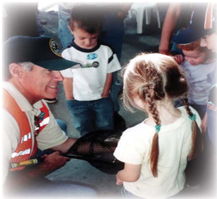
WDFW BIOLOGIST AND FRIENDS AT PUYALLUP FAIR

The CWCS includes specific conservation and acquisition recommendations for each priority habitat type. These recommendations will be used to: