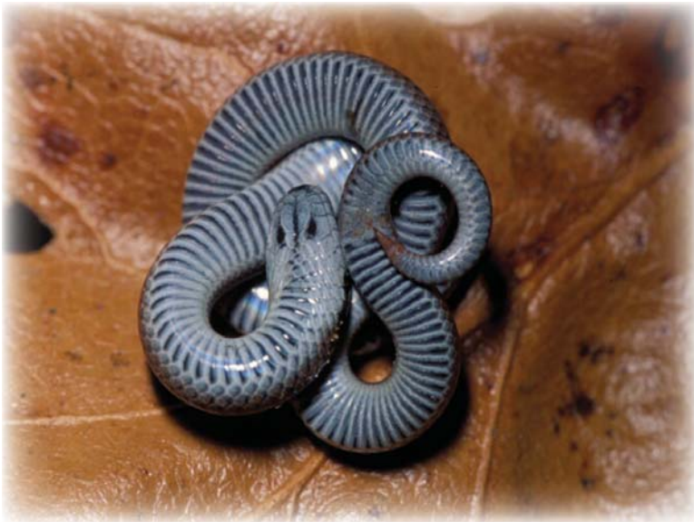
SHARPTAILED SNAKE