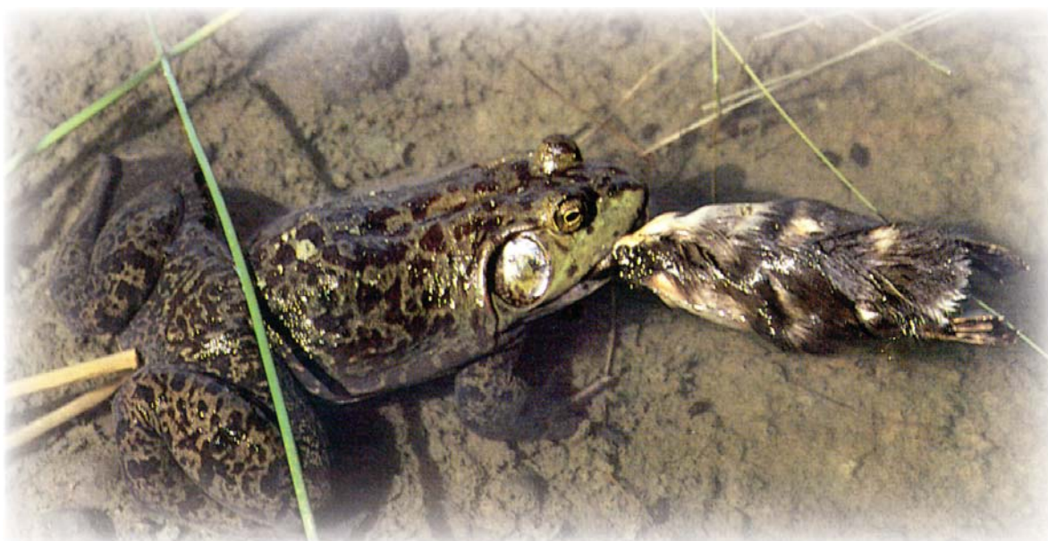
BULLFROG EATING DUCKLING

Invasive, non-native plants and animals outcompete and displace native species, profoundly changing natural systems. Invasive alien species evolve in other parts of the world and arrive in Washington without the natural predators and diseases that control their growth in their native environment. This is a critical problem for native fish, wildlife and biodiversity, and for our vital agricultural industry.