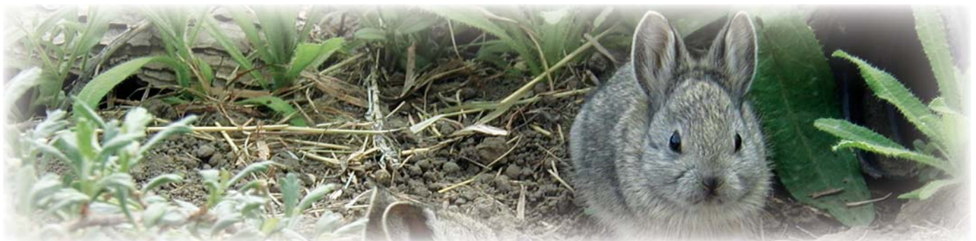
PYGMY RABBIT | tara davila