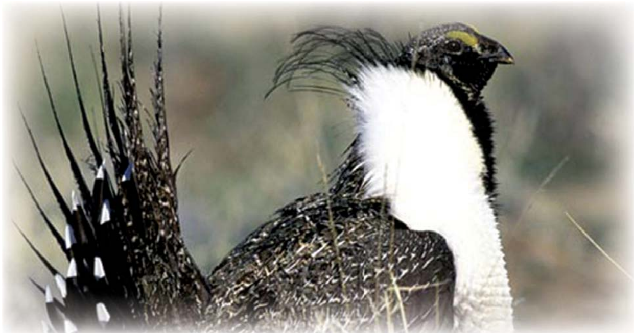
GREATER SAGE-GROUSE | u.s. forest service

Some examples of Species of Greatest Conservation Need and their associated priority habitats are shown in photos throughout this booklet.