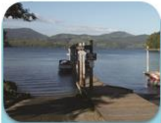
Boat & Equipment Access