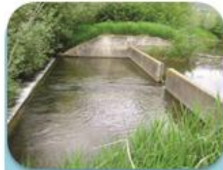
Flood Control Devices