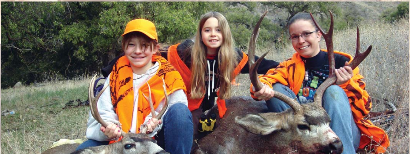
Safe hunters with their harvest

Victim was hunting ducks from a layout blind in a field. The victim was holding his shotgun across his chest with the barrel pointed at his feet. At some point the shotgun discharged striking the victim in his foot. The victim reported during an interview that he was not utilizing the safety mechanism on the shotgun.