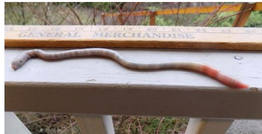
Giant Palouse Earthworm

A large, pale or white earthworm, this species has until relatively recently been considered endemic to the Palouse prairies of eastern Washington and Idaho, where it was discovered in 1897. This species is considered to be “anecic”, meaning that it burrows vertically deep into the ground and lives in deep, semi-permanent burrows, coming to the surface in wet conditions. Burrows have been found at a depth of 15 feet.