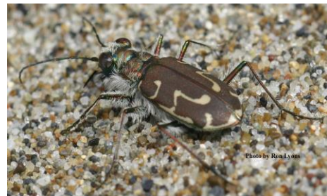
Siuslaw Sand Tiger Beetle

Four Carabidae beetles are designated as SGCN in Washington; two are ground beetles (subfamily Carabinae) and two are tiger beetles (subfamily Cicindelinae). Carabid beetles live on and in the soil; carabid SGCN depend on a narrow range of soil conditions within rare habitat types. Carabids are key predators of the insect world; as both larvae and adults they feed on other insects and, to a lesser extent, plant material. Adults hunt by sight and are fast runners that can quickly subdue their prey. Siuslaw Sand Tiger Beetle, Columbia River Tiger Beetle, and Beller's Ground Beetle adults generally forage during the day, and at night burrow into soil, sand, or other substrate. Mann's Mollusk-eating Ground Beetle is a slug and snail feeding specialist; adults hunt at