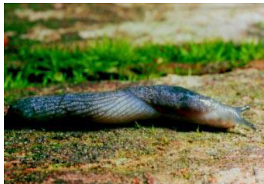
Bluegray Taildropper

Like most terrestrial gastropods, taildroppers are hermaphroditic, having both male and female organs. Although not confirmed specifically for P. coeruleum , self-fertilization has been demonstrated in some species of gastropods, but cross-fertilization is the norm. Slugs are generally oviparous (egg-laying). Eggs of Prophysaon slugs are laid in clusters in cool damp spots including under logs or pieces of wood on the shaded forest floor. Slugs are preyed upon by a variety of vertebrates and other invertebrates. Tail-dropping is a means to escape some predators. Fungi made up most (90 percent) of the identifiable food ingested by P. coeruleum ; this included a variety of mycorrhizal fungi and the species may be an agent of spore dispersal for these fungi, which are beneficial symbionts of many plants. Other food items include plant material and lichens; plant material is more commonly consumed in spring than in fall. There is no specific information available about the life history of the Spotted Taildropper.