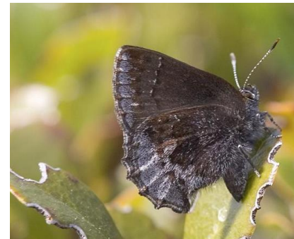
Hoary Elfin perched in kinnikinnick on south Puget Sound prairie.