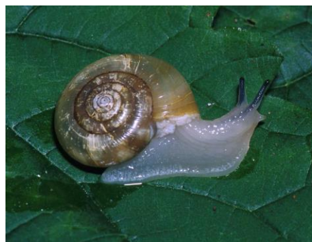
Oregon Megomphix

Snails need moisture, so where the habitat dries out, they will estivate in the summer, become active with fall rains,