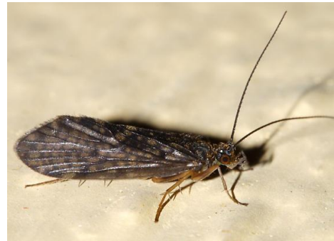
Rhyacophila acutiloba – a caddisfly in the Rhyacophila genus.