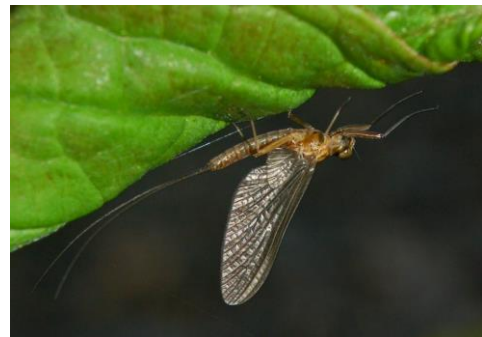
Siphonurus lacustris , a close relative of S. autumnalis .

All mayflies are aquatic in their developmental stages. Their lifespan is spent almost entirely undergoing numerous molts. Larval existence is usually three to six months, but can be as short as two weeks or as long as two years. The nymphs are generalists, moving over stones and weeds to graze off bacteria, collecting from sediments or feeding on detritus. Most species are feeders or scrapers. Adults do not eat; they have nonfunctional digestive systems. Unlike most insects, the mayfly typically has two winged stages. It is the only existing insect that molts after getting functional wings. The first stage, the subimago, is a subadult stage typically found perched on shoreline vegetation; it lasts from four minutes to 48 hours (correlated with the lifespan of the species' adult stage). Soon after it is formed (in most species), the subimago molts to form the imago, the true adult or