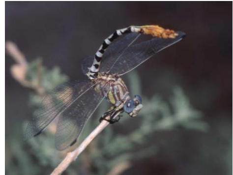
White-belted Ringtail