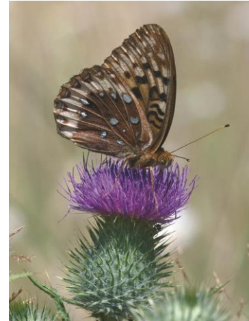
Puget Sound Fritillary