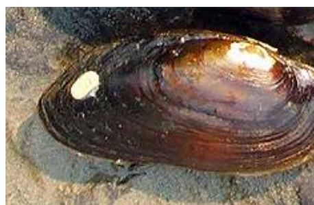
Western Pearlshell

Freshwater mussels are filter feeders that consume phytoplankton and zooplankton suspended in the water. Freshwater mussels have separate sexes, although hermaphrodites (individuals with male and female traits that are capable of self-fertilization) have been documented for some North American species, including the Western Pearlshell. Freshwater mussels have a complex life cycle. During breeding, males release sperm into the water and females filter it from the water for fertilization to occur. Embryos develop into larvae called glochidia, which are released into the water and must encounter and attach to a fin or gill filaments of host fish. Glochidia form a cyst around themselves and remain on a host for several weeks. They subsequently release from the host fish and sink to the bottom, burrow in the sediment and remain buried until they mature. During their lives, mussels may move less than a few yards from the spot where they first landed after dropping from their host fish. Because freshwater mussels are not able to move far on their own, their association with fish allows them to colonize new areas, or repopulate areas from which they have been extirpated. Freshwater mussels that live in dense beds, including Western Ridged Mussel and Western Pearlshells, provide an important water purification service; they can filter suspended solids, nutrients