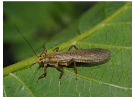
Soliperla sierra , a close relative of S. fenderi

Stoneflies usually live in areas with running water, and are important predators and shredders in aquatic ecosystems. The females lay hundreds or even thousands of eggs in a ball which they initially carry on their abdomens, and later deposit into the water. The eggs typically hatch in two to three weeks, but some species undergo diapause as eggs during the dry season. The nymphs physically resemble wingless adults, but often have external gills, which may be present on almost any part of the body. The nymphs (technically, "naiads") are aquatic and live in the benthic zone of well-oxygenated creeks and lakes. In early stages (called instars), stoneflies tend to be herbivores or detritivores, feeding on plant material such as algae, leaves, and other fresh or decaying vegetation; in later instars, the nymphs of many species shift to being omnivores or carnivores, and some species become predators on other aquatic invertebrates. The insects remain in the nymphal form for one to four years, depending on species, and undergo from 12 to 33 molts before emerging and becoming terrestrial as adults. Stonefly adults are generally weak fliers and stay close to stream, river, or lake margins where the nymphs are likely to be found. The adults emerge only during specific times of the year and only survive one to four weeks. As adults, very few stonefly species feed but those that do, feed on algae and lichens, nectar, or pollen.