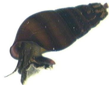
Genus Juga

Juga species are freshwater aquatic snails with tall conical shells, native to the streams and springs of the Pacific Northwest and the Great Basin. Juga snails are characterized as rasper-grazers, feeding on both algae and detritus on rock surfaces and deciduous leaf litter. They exhibit seasonal migrations both upstream and downstream. The egg masses of Juga are most often found in loose (non-cemented) but stable cobble substrate, with free and fairly vigorous flow through at least the upper substrate layers. Egg masses are located under rocks in the spring, and eggs hatch in one month. Juga species live from five to seven years, reaching sexual maturity in three years, and can continue to grow.