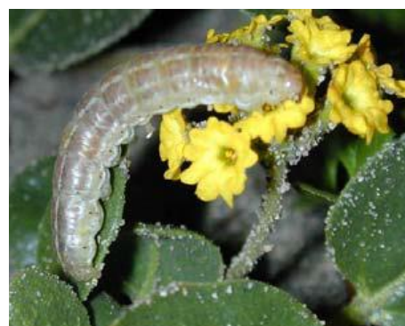
Sand Verbena Moth larva feeding on host flowers.

The Sand Verbena Moth was discovered on a few coastal beach sites on Vancouver Island, British Columbia, Canada, and Whidbey Island, in northwestern Washington, and described as a new species in 1995. The three additional Copablepharon moth species were described in 2004. They inhabit small, geographically isolated sand dune complexes in the Columbia River Basin of eastern Washington, rare ecological systems that are threatened by several factors. There has been little study of the biology and life history of these species. Sand Verbena Moth has received some attention from Pacific Northwest biologists; however, even