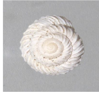
Limestone Point Mountainsnail

Mountainsnails are terrestrial gastropods of western North America. Mountainsnails eat leaf litter, detritus, and microorganisms on the surface of logs, rocks, or soil. They are hermaphroditic, having both male and female organs. They are live-bearers; the eggs hatch before leaving the uterus of the parent, and they raise their young within their shells until they reach a certain size. It is not known how long they live, or how often they reproduce.