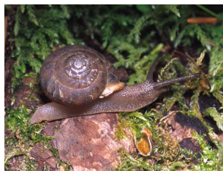
Dalles Hesperian

Polygyrids are generally herbivorous and fungivorous snails; Dalles Hesperian feed by scraping algae, yeast, bacteria and diatoms from rock and woody surfaces; they may also consume green plant materials (Duncan 2009). All of the species addressed here are terrestrial, except the Washington Dusksnail ( Amnicola sp. no.2 ), which is a freshwater snail. Washington Dusksnail is a detritivore and grazes along the stems and leaves of aquatic plants eating small organisms clinging to this material (Frest and Johannes, 1995). In most terrestrial gastropods, cross-fertilization appears to be the norm, but self-fertilization can occur in at least some species in the absence of