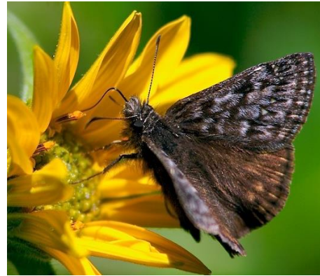
Propertius Duskywing