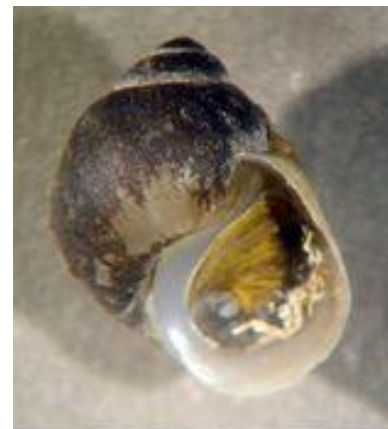
Ashy Pebblesnail