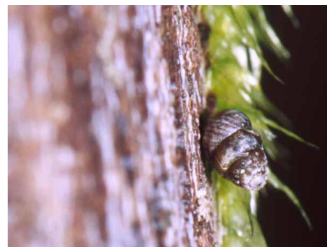
Vertigo columbiana

The Vertiginidae are minute (roughly .05 to 0.12 inch) terrestrial snails with ovoid-shaped shells. Land snails, including Vertiginid snails, are hermaphroditic and exchange gametes with conspecific individuals when conditions are favorable. At least some species seem to retain the fertilized eggs and give birth to small numbers of live young. The Hoko Vertigo is thought to be a short-lived species with a potential life span of less than two years. The distinctly arboreal lifestyle and mouthparts of this group of snails suggest that they feed on microorganisms growing on the surfaces of smooth-barked trees and shrubs or epiphytic lichens. In Pacific Northwest forests, Vertiginidae snails overwinter on tree limbs, so presumably they are not killed by freezing temperatures.