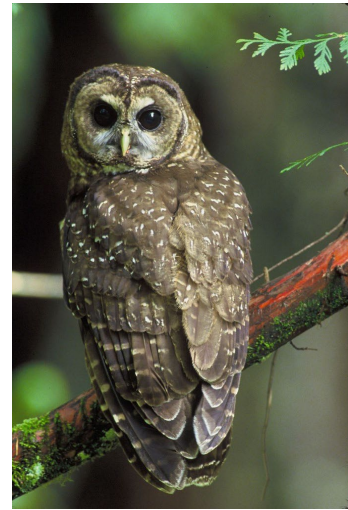
Figure 1. Northern Spotted Owl.

The Northern Spotted Owl ( Strix occidentalis caurina ; hereafter, Spotted Owl, (Fig. 1) is one of three recognized Spotted Owl subspecies (Funk et al. 2008) and is the only subspecies found in the Pacific Northwest (Gutiérrez and others 1995). The Spotted Owl was listed as endangered in Washington by the Fish and Wildlife Commission in 1988, and as federally threatened by the U.S. Fish and Wildlife Service in 1990 (U.S. Fish and Wildlife Service 1990).