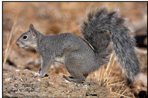
Figure 1. Western gray squirrel (photo by Joseph V. Higbee).

Description, taxonomy, and legal status. The western gray squirrel is the largest of three native tree squirrel species in Washington. It has gray pelage on the back and flanks contrasting with pure white on the belly and throat (Carraway and Verts 1994, Verts and Carraway 1998). It also features a long bushy tail that is primarily gray with white-frosted outer edges. The species has prominent ears that can occasionally be reddish-brown on the back in winter (only visible upon close inspection) and are the only part of the animal's pelage that may have any brown. The large size, bushy tail, and gray pelage lacking any brown on the body or tail distinguish western gray squirrels from other squirrels in Washington. Vocalizations include a hoarse "chuff-chuff-chuff" barking. Three subspecies are recognized, with S. g. griseus present in Washington.