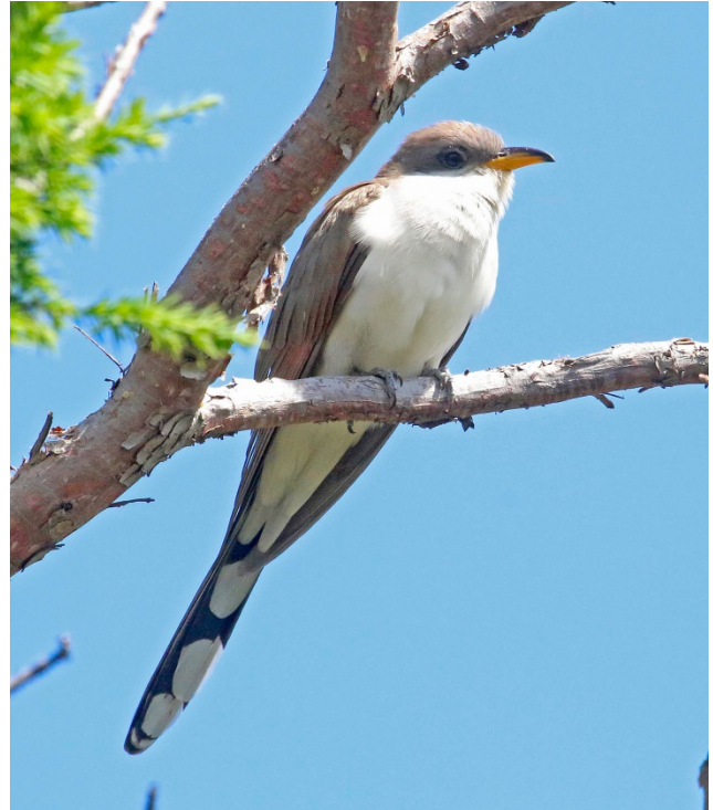
Figure 1. Western Yellow-billed Cuckoo.

Yellow-billed Cuckoos are medium-sized birds featuring unmarked grayish brown upper plumage, white underparts, large reddish brown wing patches, a long brown tail marked with bold white spots, and a mostly yellow, curved bill (Figure 1). Birds measure about 30 cm (12 in) in length and weigh about 60–80 gm (2.1–2.8 oz); females average slightly larger than males (Hughes 2015). Birds in western North America are slightly larger than those in eastern North America (Franzreb and Laymon 1993, Hughes 2015). The species gives a variety of vocalizations, the best known of which is a rapid guttural ka, ka, ka, ka, ka, kom, kom, komlp, komlp, komlp (Payne 2005 Hughes 2015). Other calls include a knocking-like kom, kom, kom, kom and a series of cooing notes.