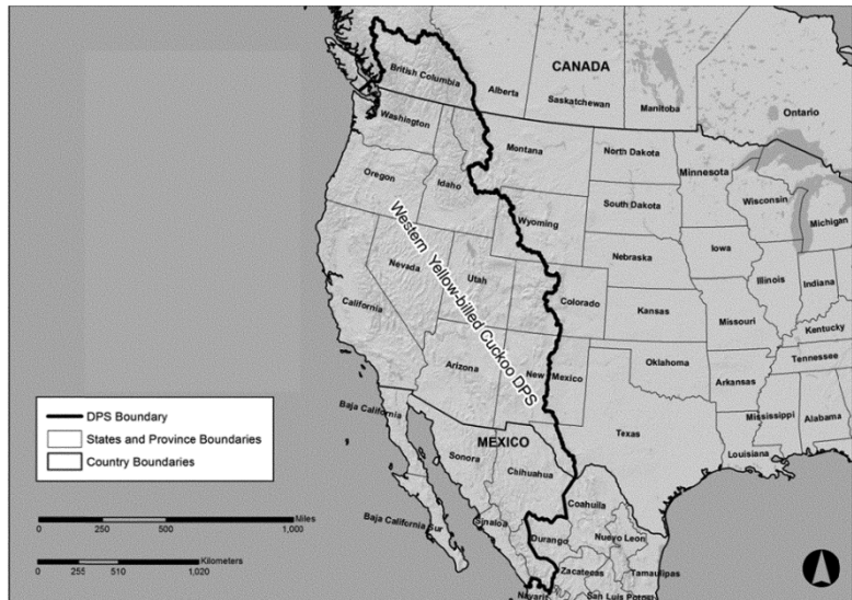
Figure 2. Historical breeding range of the western Yellow-billed Cuckoo distinct population segment (USFWS 2014a).

The historical breeding range of the species included most of the continental United States, small areas of southern Canada, and portions of northern Mexico, the Yucatan Peninsula, and the Caribbean (Payne 2005, USFWS 2014a). The species passes through Central America, the Caribbean, and northern South America during migration and overwinters east of the Andes in South America (mainly Bolivia, Paraguay, southern Brazil, and northern Argentina; Payne 2005). The breeding range of the western DPS once extended from southern British Columbia through much of the western U.S. and northwestern Mexico (Figure 2), but current distribution within this region is now largely restricted to a few areas of the Southwest, California, and Mexico (USFWS 2014a).