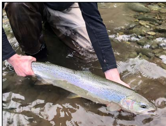
An adult return from the smolt release group.

Based on the results of the Hamma Hamma pilot study, in the generation after supplementation ended there was a 2.6-fold increase in redd abundance, while the control streams either remained the at the same levels or declined. Additionally, there was an increase in genetic diversity in the population. While there are still a couple of years of monitoring to go for the post-supplementation period on the other streams, the initial results also indicate an increase in redd abundance.