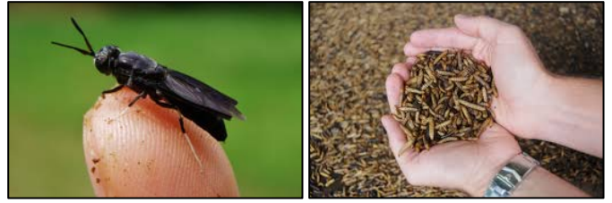
Photos of BSF adult and larvae from the Enterra website.

Successful hatchery production requires a sustainable source of protein for their fish feed. Unfortunately, production of fishmeal can deplete ocean fish stocks and are subject to price fluctuations. Plant-based protein sources, such as soybean, requires significant agricultural inputs that could otherwise be used to grow food for people. Most fish diets include a wide variety of ingredients to meet nutritional needs. In the wild, insects are a natural source of digestible protein and fat for salmon and trout. So, can insects play a functional role in addition to a nutritional role in a hatchery system?