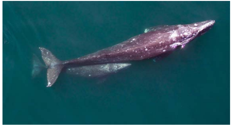
Figure 1. Gray whale mother with calf.

This species is a large baleen whale. Adult males reach 15 m and weigh 16,600 kg. Adult females reach 15 m in length and may weigh as much as 34,000 kg when pregnant (Rice and Wolman 1971, Shirihai and Jarrett 2006). Adult gray whales are slate gray and are covered by gray/white patterns (Figure 1), allowing identification of individuals. This mottled coloring occurs naturally as the animal reaches adulthood and is further enhanced as a result of crustaceans ('whale lice', i.e.