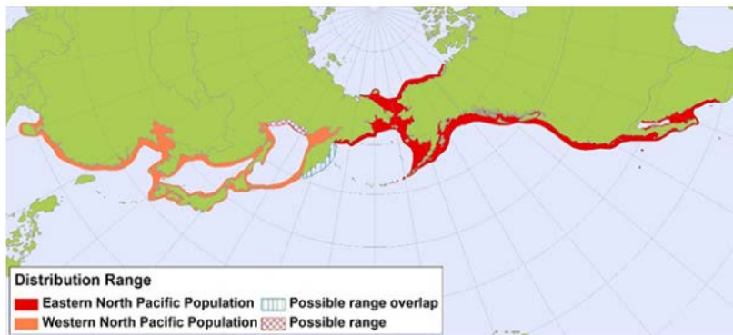
Figure 2. Hypotheses of gray whale population structure prior to recent information on movements across the Pacific (IUCN/IWC Conservation Management Plan).

three primary lagoons (Rice and Wolman 1971, Ford 2014, Sumich 2014, Cooke et al. 2017). Animals are occasionally sighted south of the Baja peninsula along Mexico's west-central coastline and near Isla Clarion (Sumich 2014).