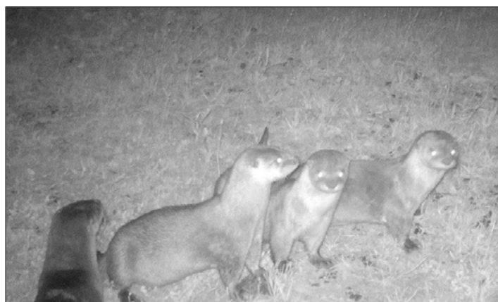
Game camera photo of river otters at a latrine site along the Green-Duwamish River, King County, WA.

Polychlorinated biphenyl (PCB) concentrations from river otter scat collected at latrine sites along the Green-Duwamish River, King County, WA. Values are geometric means. Samples analyzed at two separate laboratories, represented by two axes; methods vary – see axes titles. Yellow rectangle represents the Lower Duwamish Waterway Superfund site (river miles 0-5).