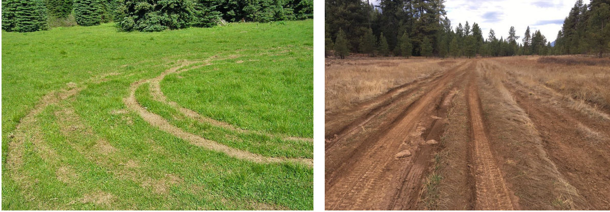
Figure 4. ORV tracks and damage at BLM's Moon Prairie in southern Oregon and Midway Meadow in Gifford Pinchot National Forest, Washington (Kogut 2008).

Military training on JBLM-AIA. The closed, undeveloped nature of the JBLM-AIA, coupled with the frequency of low-intensity fires, has in some areas maintained significant patches of mardon skipper habitat. But in some areas frequent fires represent a significant threat to mardon skipper persistence. For example, Range 50 is an area where the largest remaining mardon skipper site occurs has burned consistently over the past three years (2021-2023) due to ignition from military training activities. Continued monitoring at this site will be critical to track changes. The frequency and type of use in the JBLM-AIA has changed over time. Over the past two decades, changes in military training needs have led to the development of new roads, and training and target structures (M. Linders, pers. comm.). Increased fire frequency and earlier fire timing (e.g., in June) mainly due to climate warming (see Climate Change section below) are also likely threats to mardon skippers and their habitat (R. Gilbert, pers. comm.).