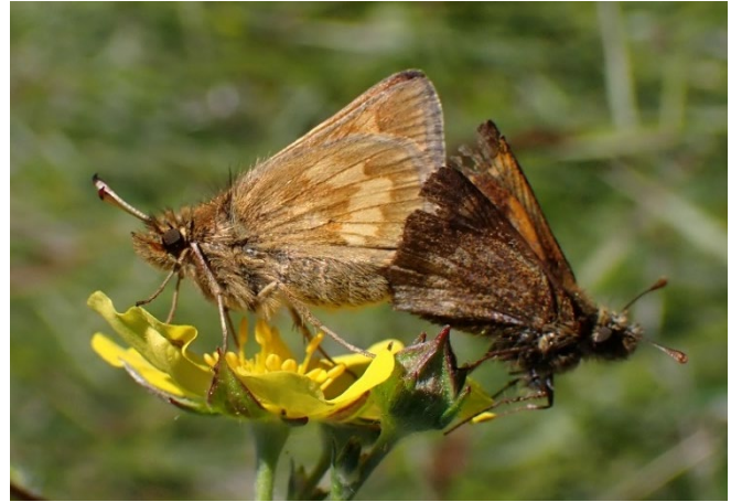
Figure 1. Female (left) and male (right) Mardon Skipper.

The mardon skipper butterfly is a small (<1 in; 20-24 mm) tawny-orange butterfly with a stout, hairy body (Figure 1). Skippers are small butterflies that get their name from their fast erratic flight; they can be recognized because when perched, they hold their front and hind wings at different angles. Mardon skipper is a grass skipper in the subfamily Hesperinae whose larvae (caterpillars) feed on grasses and sedges.