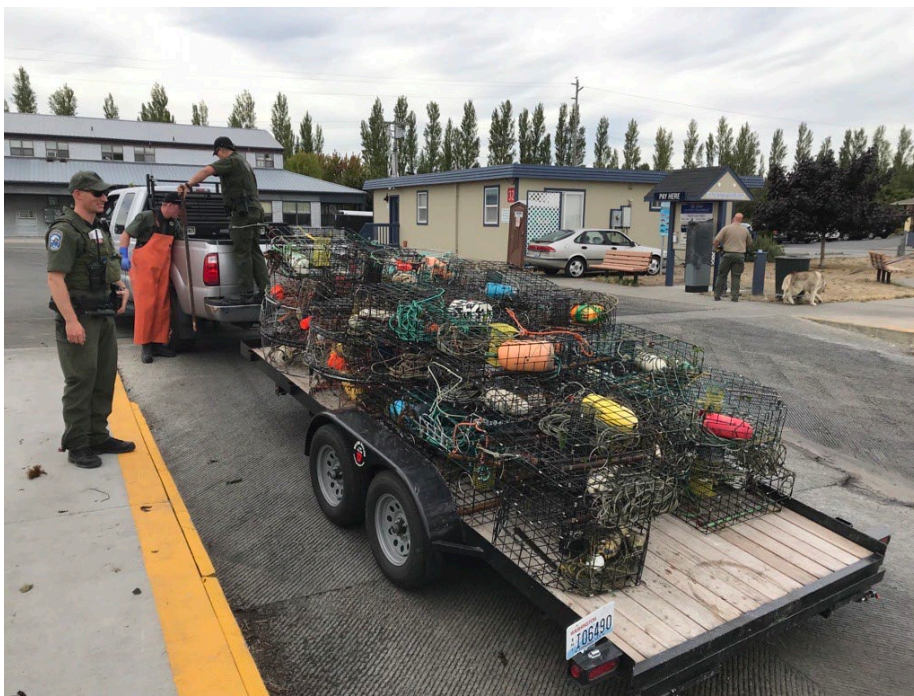
Figure 1. Recovered derelict pots on a trailer in Port Townsend following an enforcement gear sweep in 2021.

To fulfill requirements of RCW 77.32.430, dedicated derelict shellfish gear recovery funds expended in 2023: $284,967.