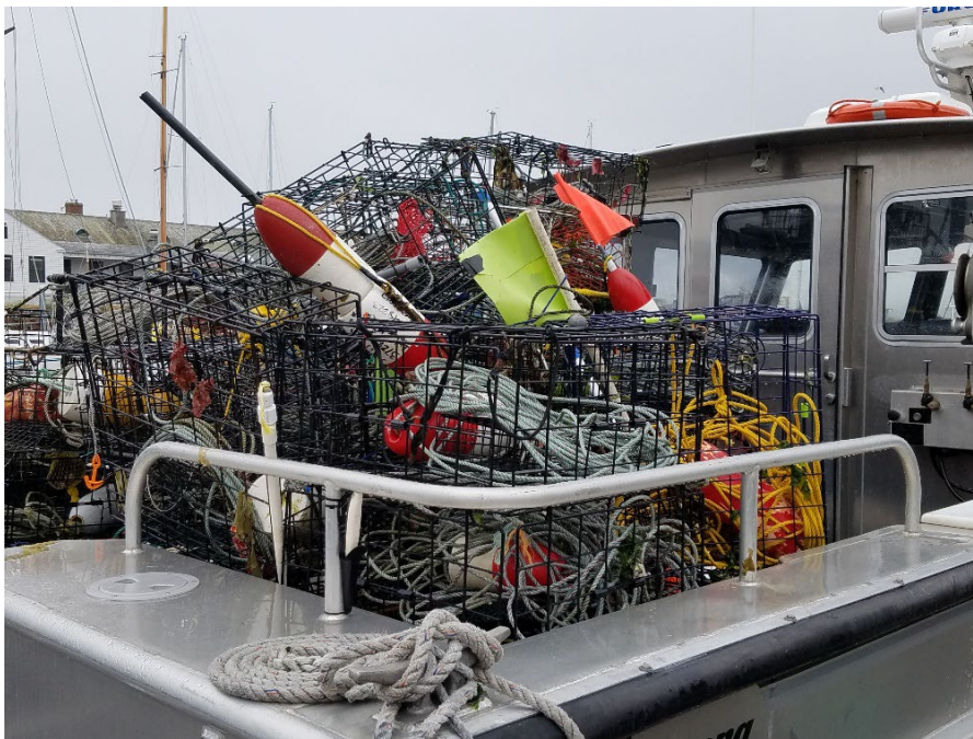
Figure 2. Derelict crab pots removed from Puget Sound by WDFW staff.

WDFW enforcement officers and biologists coordinate to conduct crab pot sweeps during the popular summer recreational crab fishery. The sweeps, funded by additional revenue from the sale of crab endorsements, took place on days when the recreational fishery was closed each week during the season. In 2023, this effort removed 1,283 crab pots from Puget Sound, including recreational, state commercial, and Treaty commercial pots. A total of 2,104 legal-size male crabs were released from these traps when they were recovered. A total of 22 WDFW enforcement officers or interns and five shellfish staff worked 48 vessel days on the water, and additional days returning pots or disposing of the gear.