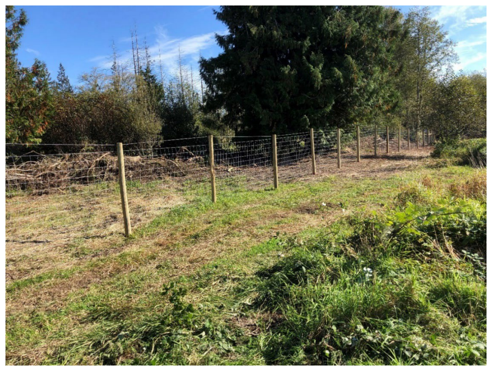
Completed woven wire fencing on property adjacent to SR20.