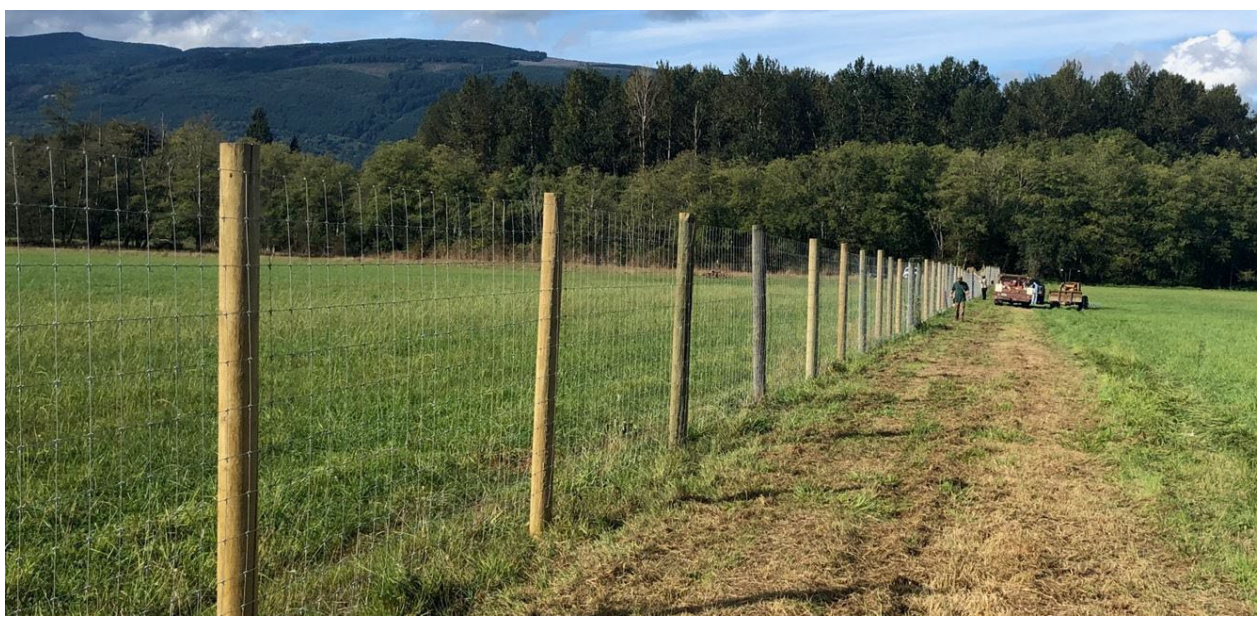
Fencing project in Day Creek.