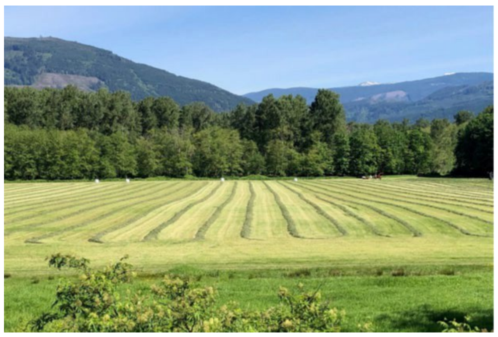
Hay field in Day Creek that was cut early after being fertilized with funding from the Crop Mitigation Program.